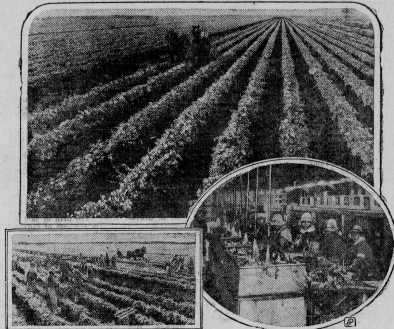
"Banking long rows of celery (top) on the "world's largest" single celery farm near Stockton, Cal., is followed by harvesting (lower left) and packing (lower right).

Stockton, Cal. — More than a square mile of celery in a single bed—approximately 21,450,000 bunches in all—and each one planted by hand.