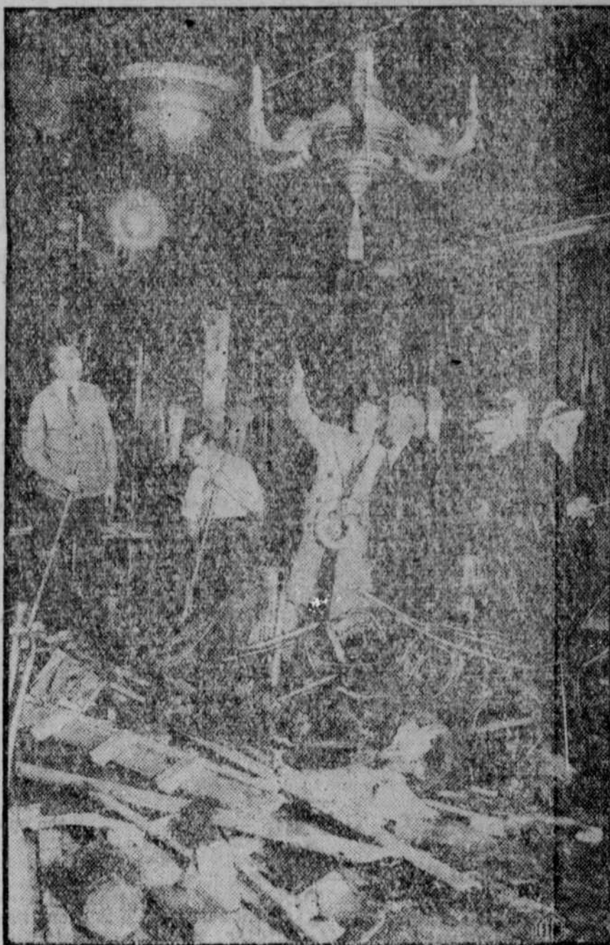
An interior view of the ruins left by the disastrous fire which swept through the club, "Argonaut," owned by Texas Guinan, showing the place. Furnishings worth $40,000 were destroyed.