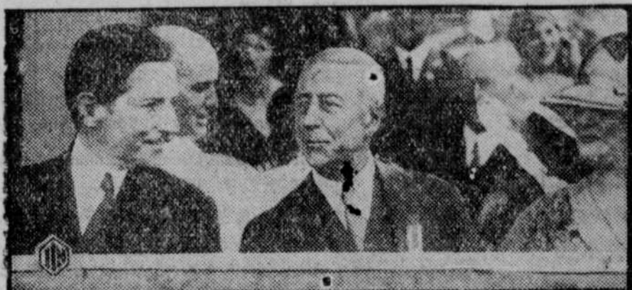
Secretary of War Patrick Hurley chatting with Secretary of the Navy Charles Francis Adams at the War College during the opening of the annual army show.