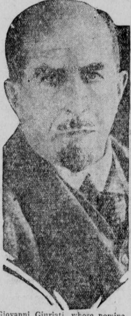
Giovanni Giurati, whose nomination as Secretary General of the Fascist Party has been confirmed, wins, with the exception of Mussolini, the highest post in Italian Fascist ranks. He was with Gabriele D'Annunzio when the latter seized Fiume in 1919.