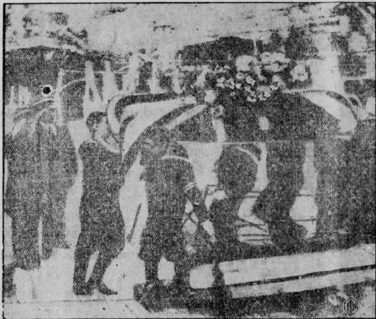
British sailors carrying ashore, at Dover, England, the flag-draped coffins containing the bodies of the victims of the ill-fated dirigible R-101, from the destroyer "Tempest," which brought them back from France. The forty-seven caskets were taken by train to London and placed in the Westminster Chapel mortuary as all Britain paid solemn tribute to the dead heroes of the disastrous flight. Memorial services are to be held in St. Paul's Cathedral, after which the bodies will be buried at the Cardington Air Field.