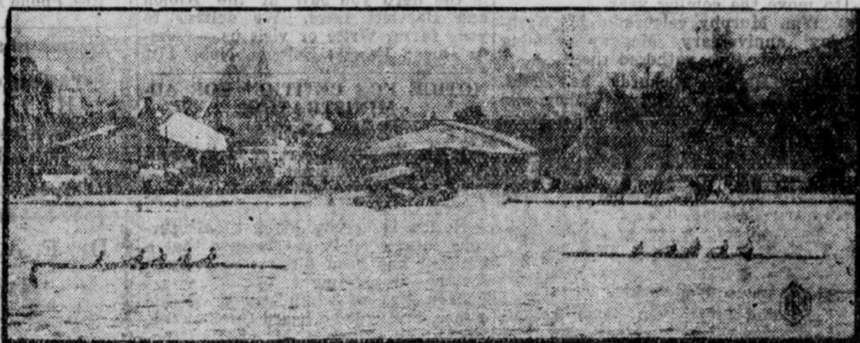
Again the din of battle is heard along the shores of the historic Meuse. But this time it is only the cheers of the citizens of the participant nations in European championship regatta, urging their respective crews to victory. Above, the South Side Boat Club of Quincy, Ill., representing the United States in the four-oared class. The American boat sweeps to victory over the Hungarian crew.