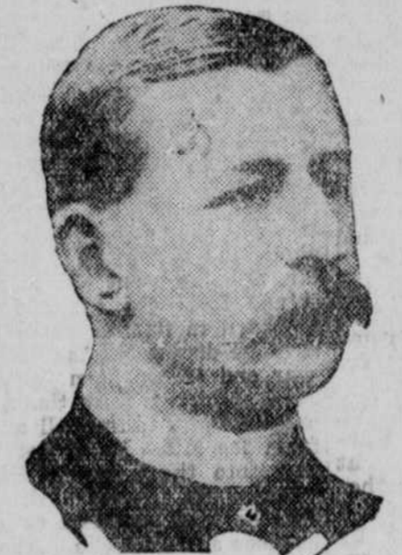
Salomon August Andres (above), explorer and aeronautist, who with two companions started for the North Pole in a balloon 32 years ago last month, was found frozen to death on an island in Franz Josef Land, August 6, by a Norwegian fishing vessel. The body of an unidentified comrade of Andres' was also found. Both were in a remarkably good state of preservation.