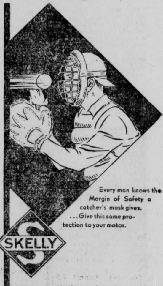
Every man knows the Margin of Safety a catcher's mask gives. ... Give this same protection to your motor.

We know you will appreciate the greater Margin of Safety The Improved Tagolene will give. Stop in today. Let the Improved Tagolene protect your car—eliminate needless repair bills.