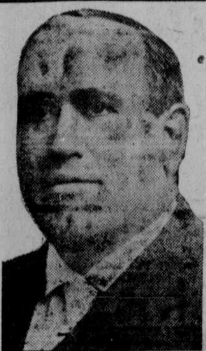
W. M. STEBBINS GOTHENBURG

REPUBLICAN CANDIDATE FOR United States Senator