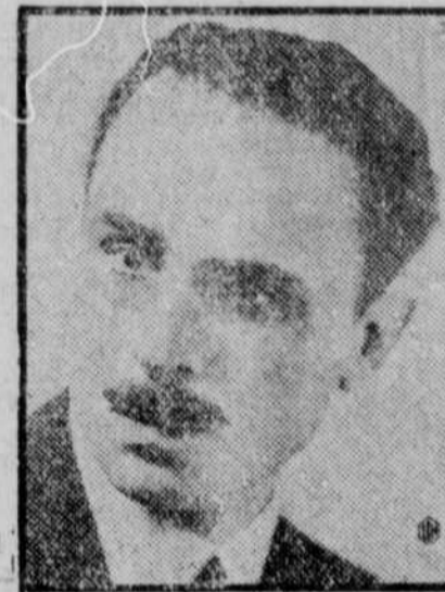
Sir Oswald Mosley, millionaire baronet from an old English Tory family, whose conversion to Socialism created a sensation a few years ago, after an interview with Premier MacDonald, resigned his post in the Labor Cabinet because of dissatisfaction with the Labor Government's program for combating unemployment.