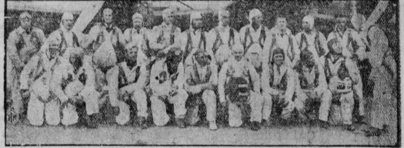
Here are the twenty parachute jumpers, composed of three army men and seventeen civilians, beside their giant Curtis Condor plane, in which they broke the world's record for the largest number of jumpers to leap from a plane within the shortest space of time. All the men left the ship practically at the same instant. The daring and record-breaking stunt, held at Roosevelt Field, L. I., was the feature of the National Moose field day celebration.