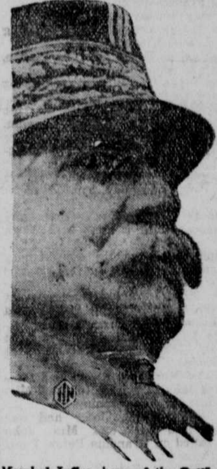
Marshal Joffre, hero of the Battle of the Marne, who was reported seriously ill at his country residence at Louveciennes, near Paris, denies reports of ill health. He has differences and opinions and write written his memoirs of the war-time period, with the wish that its publication be posthumous.