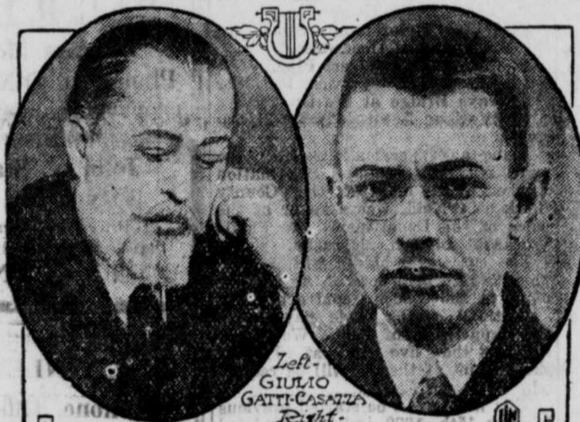
For the fourteenth time in twenty-two years of Giulio Gatti-Casazza's direction of opera in New York the Metropolitan has accepted and American work for production. The new piece is a tale of Colonial Massachusetts, American in scene as well as authorship and music. The composer is Dr. Howard Hanson, of Rochester, N. Y.