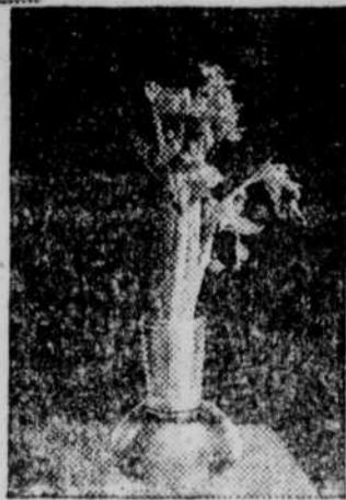
The same celery as it came from the Hydrator the following morning. The magic action of the Hydrator has restored the celery to its original state—fresh, crisp, and delicious.

Now all household Frigidaires are equipped with the Hydrator. And when you see what it does you'll be amazed. You'll wonder how such a simple device can perform such magic. For the Hydrator not only keeps vegetables fresh but actually makes wilted vegetables crisp again.