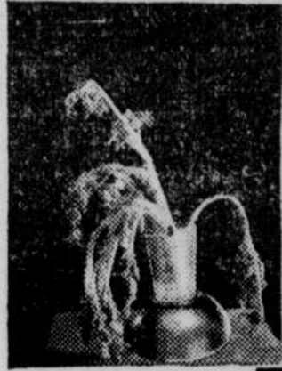
You can put celery in wilted ... like this