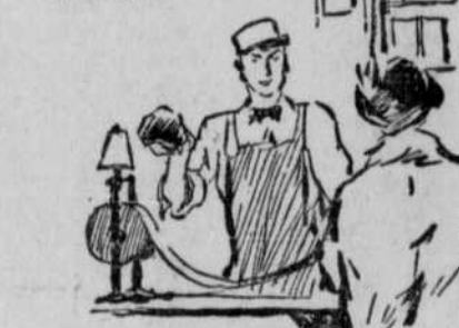
AT 18 HE CLERKED IN A GROCERY FOR $10 A MONTH