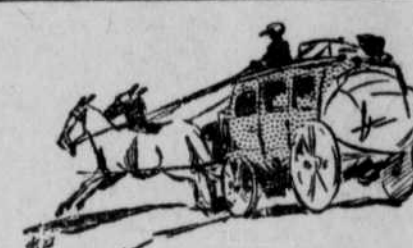
AS A BOY OF 12, SCHWAB DROVE A STAGE-COACH IN PENNSYLVANIA

In the course of these Bernardi dissipates the popular idea that the lord director declined the title of king proffered to him by his parliament because he was apprehensive of the consequences should he accept. According to the Italian, Cromwell, though not interested in the idea of being king, was most