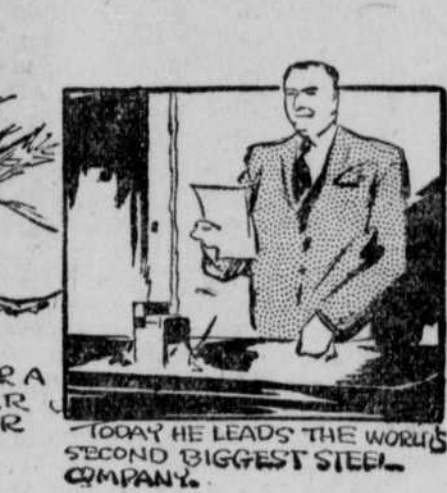
TODAY HE LEADS THE WORLD'S SECOND BIGGEST STEEL COMPANY