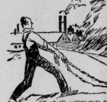
AT 19 HE WORKED FOR A STEEL MILL FOR A DOLLAR A DAY DRAGGING CHAINS FOR A SURVEYING CREW