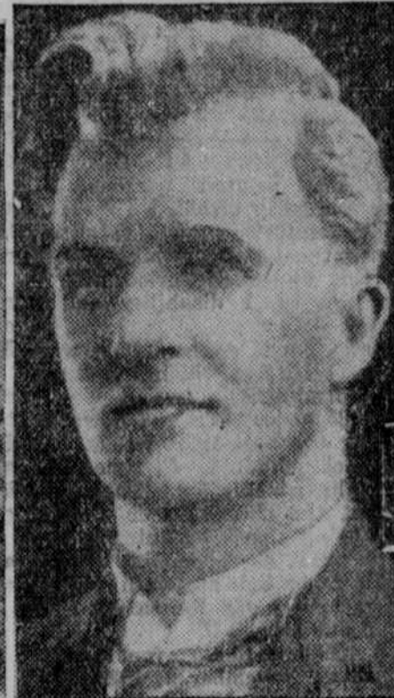
James Henry Scullin, labor leader who has been appointed Prime Minister of Australia. For the past year he has led the Labor Party that at the recent elections swept everything before them, defeating the "old guard" of Australian politics by a strong majority.