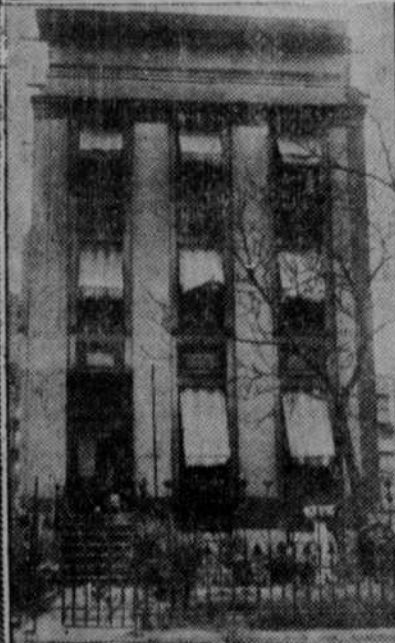
In this house were written the lines which begin "It was the night before Christmas and all through the house, etc." by Clement Clarke Moore, and it is this house at 429 West 23rd St., New York, the old Chelsea district, that is now the center of a legal battle that is holding up work on the $20,000,000 building operation to replace the famous landmark.