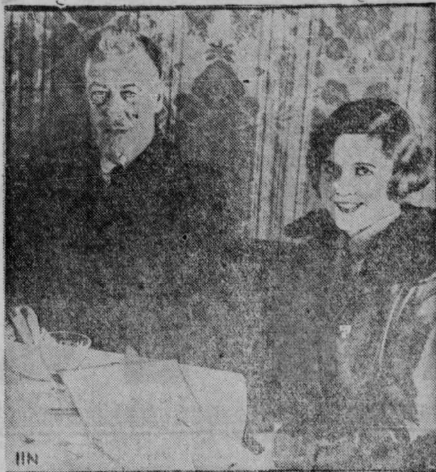
Lady Drummond Hay and Commander Hugo Eckener, seen in the dining salon of the Graf Zeppelin during the flight from Lakehurst to Friedrichshaven on the first leg of their record-breaking flight around the world. Both appear contented and happy and why not?