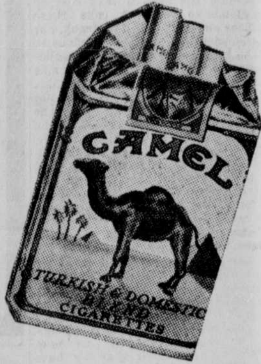
© 1929, R. J. Reynolds Tobacco Company, Winston-Salem, N. C.

Only a superior cigarette could have won and held world leadership for all these years as Camel has done.