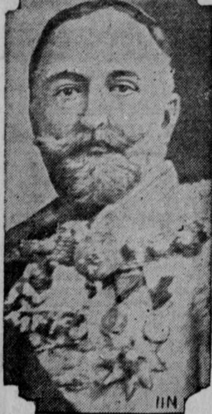
Wilhelm Miklas (above), president of National Assembly of Austria, who was elected president of the republic in succession to Dr. Michael Hainisch. The president-elect is 56 years old and a member of the Clerical party.