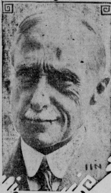
Best known, perhaps, for his development of the gyroscope and the gyro compass, Elmer Ambrose Sperry (above) has been elected president of the American Society of Mechanical Engineers.