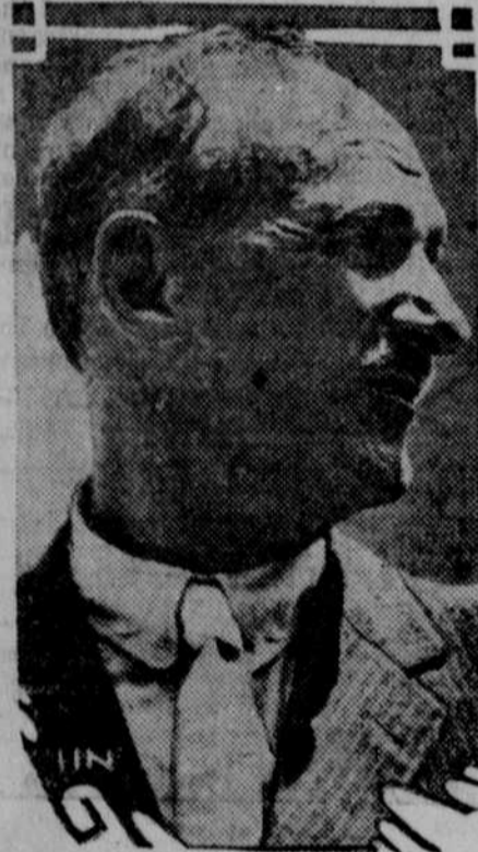
Senator T. Coleman du Pont (above), of Delaware, has forwarded his resignation to Vice-President Dawes in Washington because of illness. He intends to travel for his health.