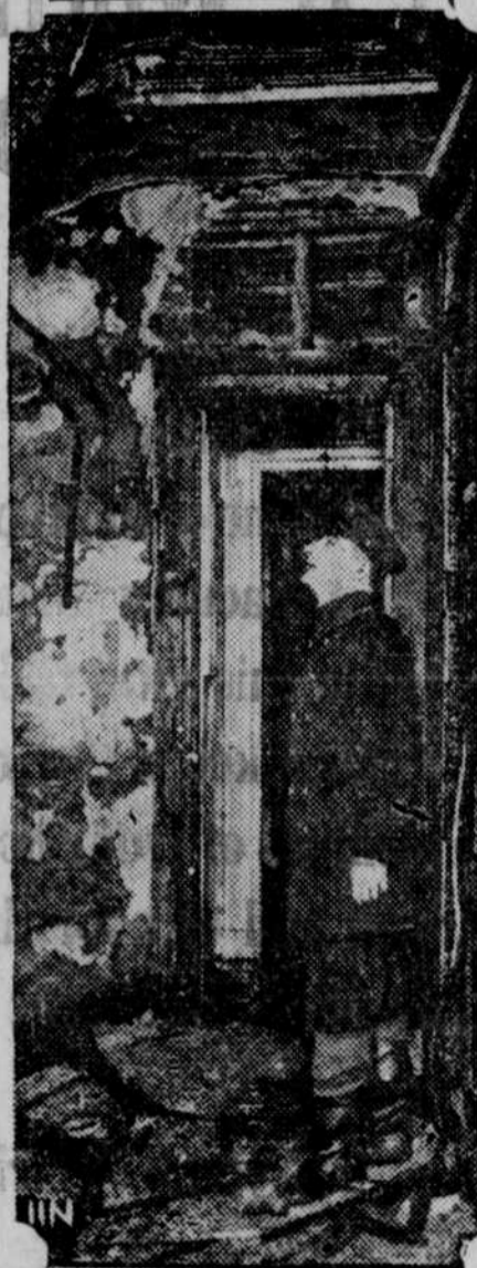
Wooden stairs which quickly took fire, cut off escape for three persons when flames mushroomed to upper stories of tenement at No. 212 E. 14th street, New York City. The fireman is shown inspecting the death trap.