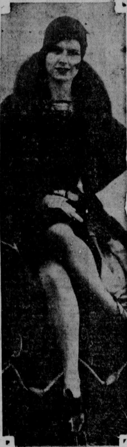
Back to the United States from a vacation in France came Louise Brooks (above), moving picture actress. She denied reports of the usual new romance and took the first train for Hollywood.