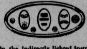
On the indirectly lighted instrument panel are grouped all controls, including the water temperature indicator and theft-proof Electro-lock.