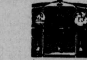
The new chromium plated radiator, lamp standards and rims, and one-piece full crown fenders are typical fine car features of the Outstanding Chevrolet.