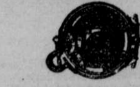
Newly designed 4-wheel brakes, safe—positive—quiet.