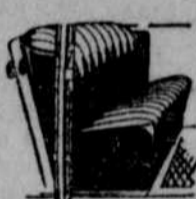
The adjustable driver's seat in all closed models. This brings the clutch and brake pedals within proper reach for all drivers.