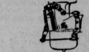
An automatic accelerating pump results in unusually swift acceleration, as well as greater gasoline economy.