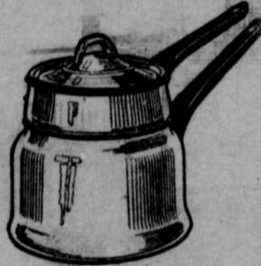
2-Quart Double Boiler New design; swelled bottom; Round, cool handles; seamless, with seamless enamel cover. Water will reach high up sides.