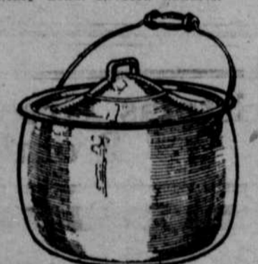
6-Quart Convex Kettle Heavy sheet steel, beautifully enameled; strong ball; varnished wood grips; easy to clean.

For Sale at All Dealers WHOLESALE DISTRIBUTORS MARSH & MARSH OMAHA AND LINCOLN, NEB.