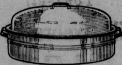
Oval Roaster Heavy sheet steel, covered throughout with beautiful glazed enamel. Seamless, easily cleaned and very sanitary. Bottom does not touch the stove, thus preventing burning. Close-fitting cover retains juices and is self-basting. Dimensions: 7 inches high, 9 inches wide, 14 1/2 inches long.