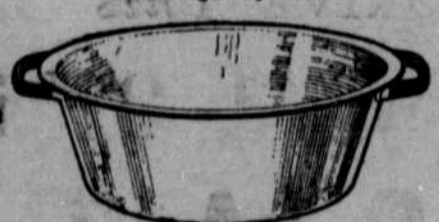
10-Quart Handled Round Dish Pan Heavy sheet steel; two strong welded handles. Wide beveled edge. Rolled sanitary head. Riveted handles.