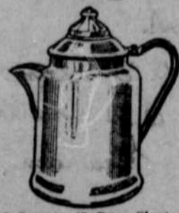
2-Quart (8-Cup Size) Percolator Seamless, single piece steel. New domestic shape, swelled bottom, aluminum inset.

HERE'S an easy way to get some of the new and popular colored enamelware. Choose for yourself. Take any or all of them. They come in handsome red, yellow or green enamel. All you need for each piece is 30 coupons from packages of Cream of Nut or Oak Grove Oleomargarine. Buy Cream of Nut or Oak Grove at your grocer's. Take your coupons to him when you want your enamelware. This deal ends October 1, 1929. Start saving coupons today!