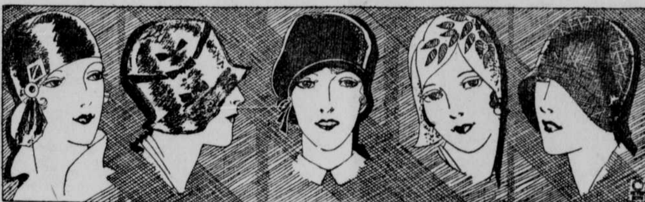
All Ladies' Hats, Choice of Entire Stock, $1.95