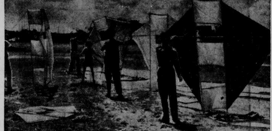
Two views of kite enthusiasts who surround Jalbert with some of his 24 creations which these youths are always ready to help him fly. Most of these kites have a pull of 100 pounds and require winds of 10 to 40 miles an hour for a takeoff. None require a running tow.