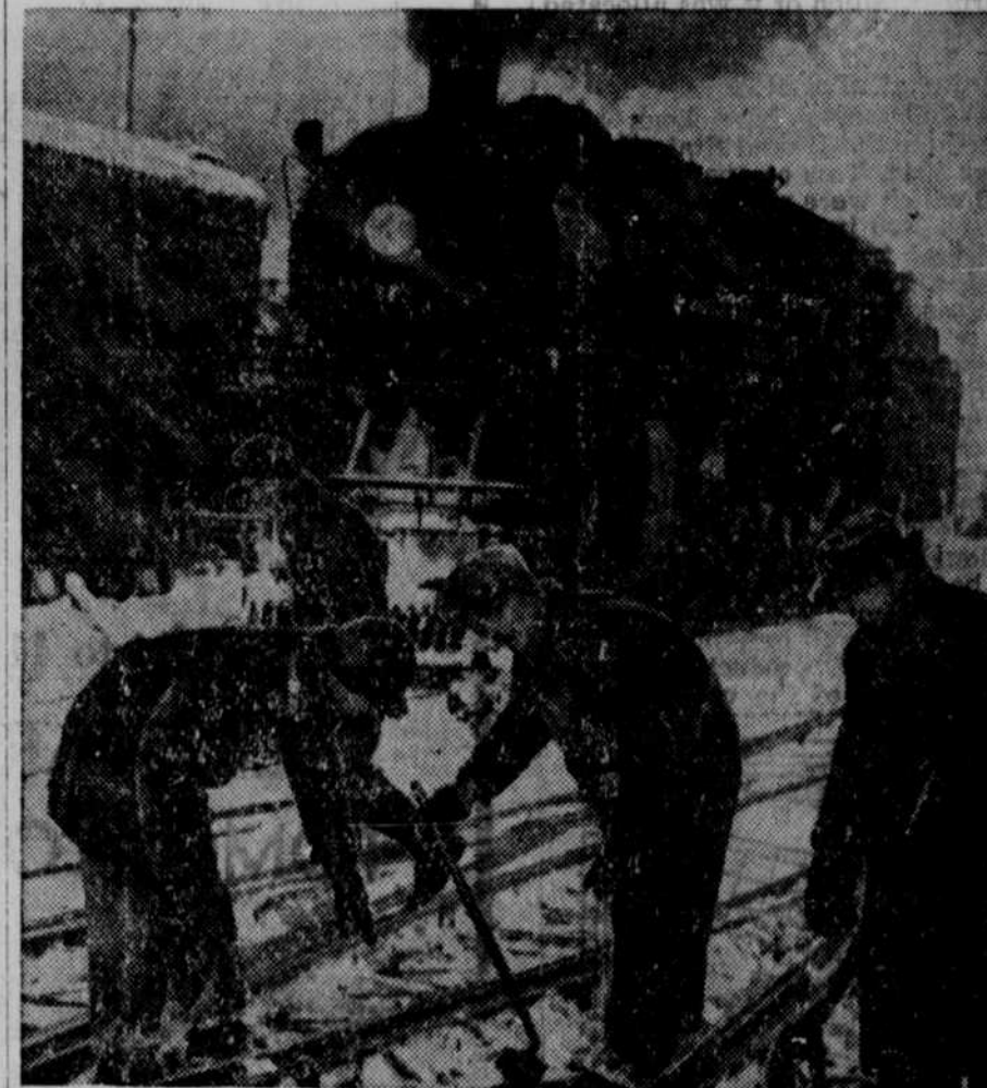
Early blizzards which swept the central west brought about the deaths of seven persons, five of them in Minnesota, where 11 inches of snow was reported in some localities. Track laborers are shown struggling to keep switches open in the Minneapolis railroad yards. Transportation and communication systems were stricken and most trains ran late.