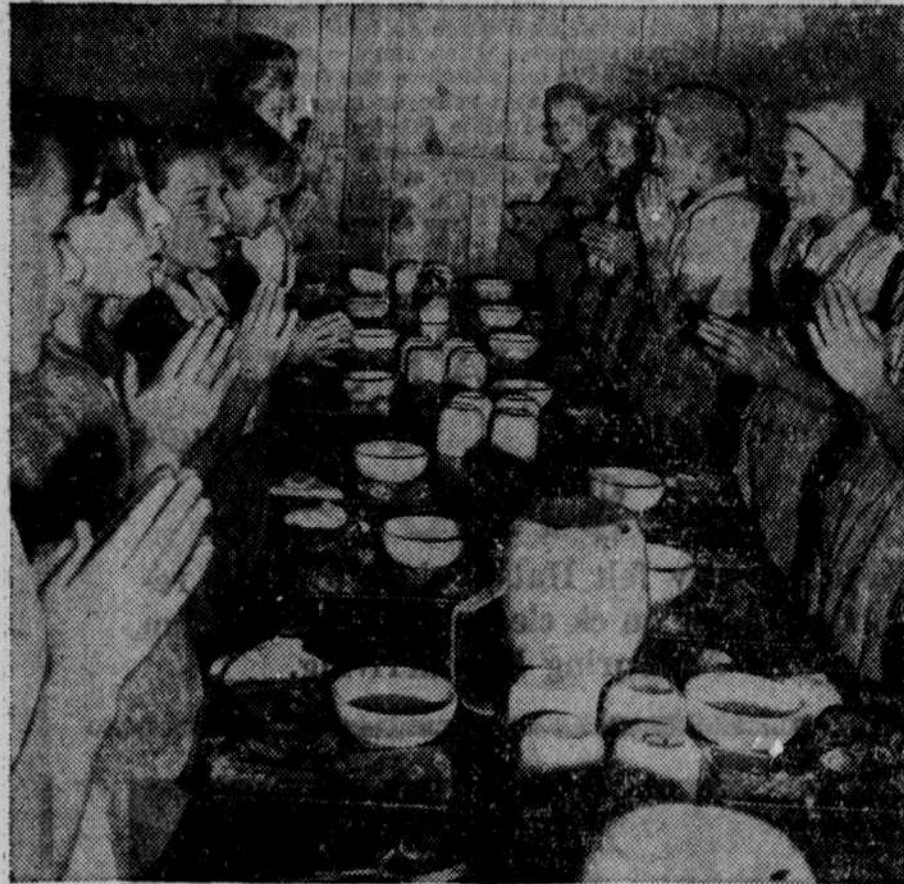
Although the words are not uttered in English they could readily be understood by a casual observer as these Polish refugee children say grace at a camp in Santa Anita, Calif. They are some of the 300 Polish refugee children who are on their way to Mexico where they will remain for the duration as wards of the Polish government in exile.