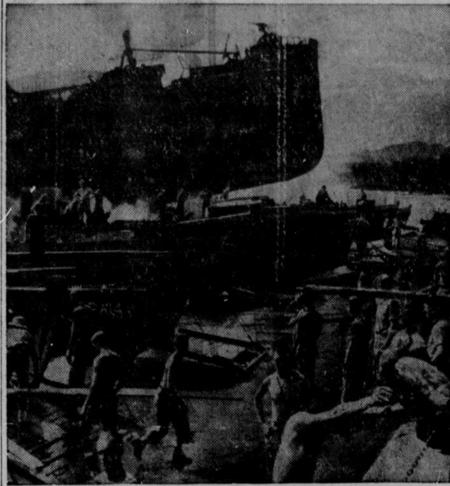
Japanese landings in the South Pacific, probably for the purpose of regaining the offensive, were foiled by United States forces. This sound-photo shows U. S. coastguardsmen and marines unloading supplies near a Jap warship, the Kinugawa Maru, which was beached after a battle. Admiral Nimitz warned the enemy of new offensives.