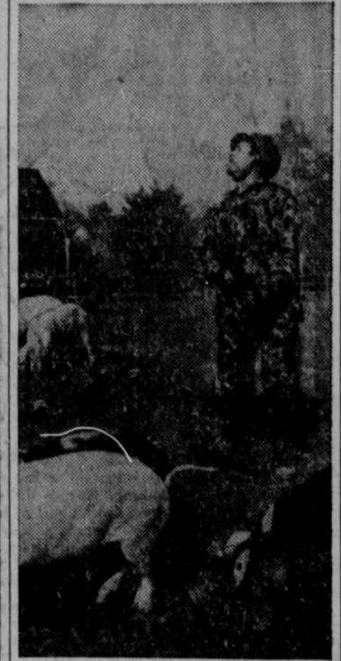
This camouflaged soldier appears to be hunting wild bears. Actually he is trying to spot an "enemy" plane during maneuvers in Tennessee. His uniform closely matches the hides of the spotted pigs.