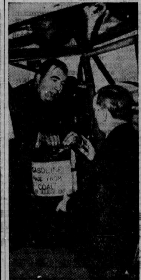
Gasoline made from coal was used in an airplane for the first time in the U. S. recently. It carried the plane from Morgantown, W. Va., to Washington, D. C. Senator Joseph O'Mahoney, Wyoming, receives a can of the gasoline from Representative Jennings Randolph.