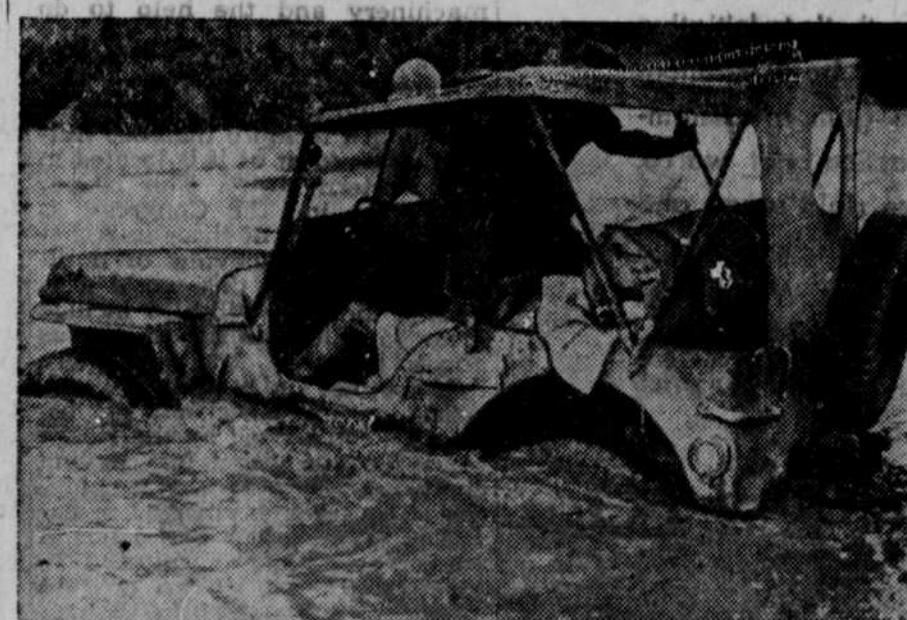
German troops destroyed a bridge near Caserta, Italy, to halt the advancing Allies. Their failure is illustrated by these British soldiers who run their jeep into the river and cross without the bridge. In an effort to protect their winter line, the Germans launched a series of furious counter attacks against most portions of the Allied Fifth army.