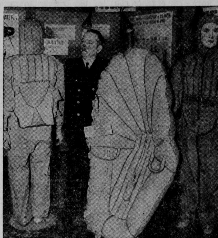
Three views of the navy's new battle dress. It protects the wearer from small fragments, flash burns, drowning, and underwater explosions. It weighs 3 pounds 12 ounces, is made of gray-green poplin, covers the entire body except the face and hands, and is padded from neck to thighs.