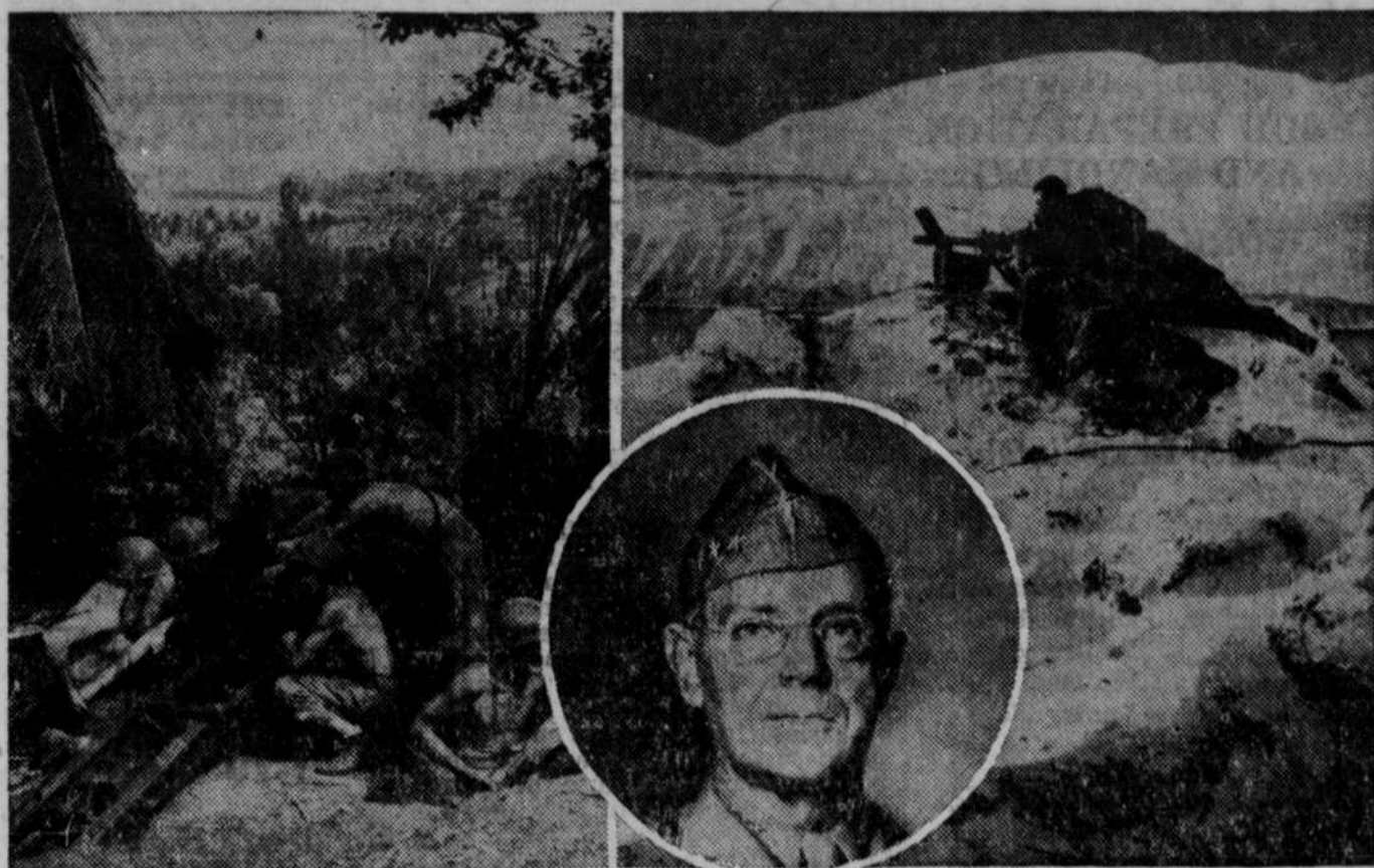
"In the air, on land, and sea" the men of the United States marine corps are fighting at America's battlefronts over the world as they celebrate their 168th birthday. Left: On Guadalcanal marine artillery experts shell a Japanese position. Their weapon is a 75-mm. pack howitzer, a favorite with marines because of its mobility. Center: Lieut. Gen. Thomas Holcomb, the highest ranking officer ever to command the marines. He served in much of the heavy fighting of World War I. Right: On a lonely hill overlooking one of the numerous Alaskan inlets, a marine machine gun crew is on the alert for any attempted landing by enemy troops.