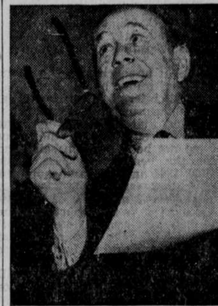
Jan Masaryk, Czechoslovakia's minister of foreign affairs and leader of that country's liberation forces, is pictured as he arrived in the United States after a London conference.