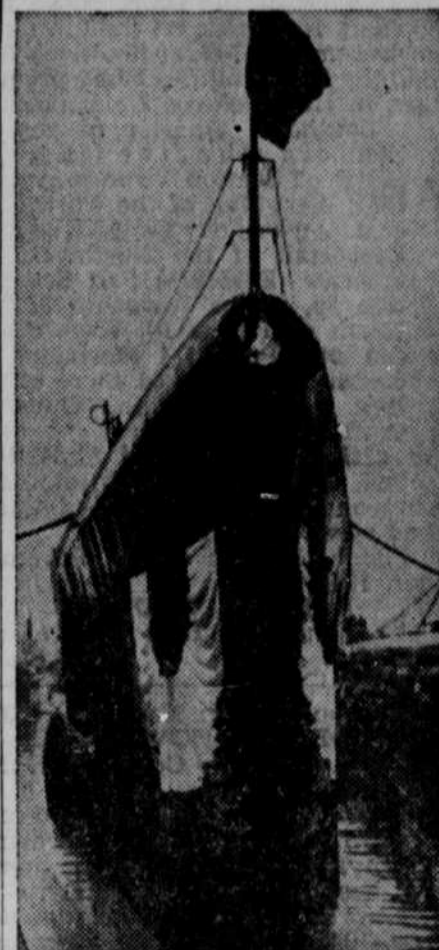
For the first time in ship launching history, three submarines were launched simultaneously. The scene was the Portsmouth, N. H., navy yards. Pictured is the "Pomfret," one of the new submarines.