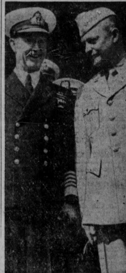
Admiral Sir Andrew Browne Cunningham and Gen. Dwight D. Eisenhower are pictured as the admiral was saluted by his men after he was appointed Britain's first sea lord and naval chief of staff succeeding Admiral Sir Dudley Pound.