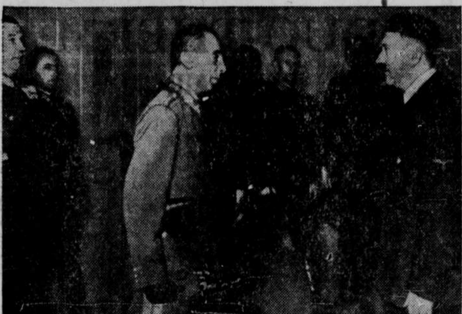
As the United Nations press back German troops on all fronts, as Allied raids over Naziland increase daily, and as native populations of Hitler's satellite countries revolt openly, puppet leaders of these little nations are constantly on the spot. Gen. Ludwig von Csata of Hungary is pictured explaining something to Hitler.