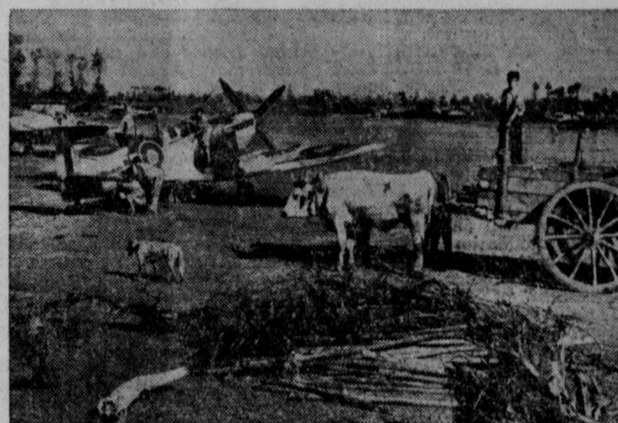
Italian peasants with their bullock cart present a strange contrast to the lightning-fast, streamliner fighter planes of the Royal Air force at an air field near Naples. The bullock team was loaned by a local farmer to clear the field for use by the RAF. This is a typical example of the co-operation Italian and Sicilian peasants have given the Allied armies as our forces steadily move northward toward Rome and Berlin despite desperate German resistance.