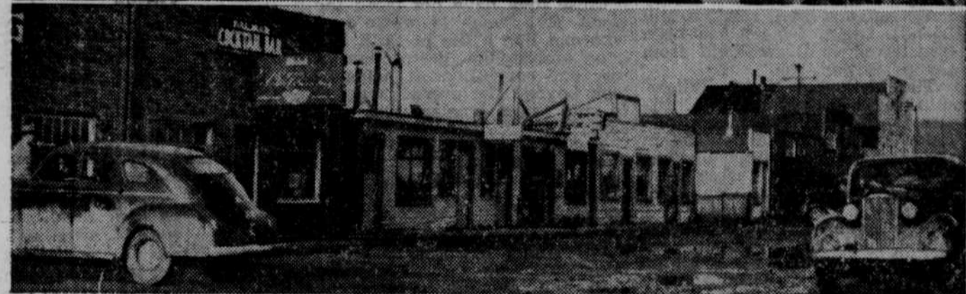
The American spirit of co-operation is clearly in evidence at Matanuska Valley, Alaska, where soldiers from nearby camps are helping farmers harvest the bumper 1943 potato crop. Top left: Soldiers operate the community's unique digging machine designed by the farmers which digs potatoes, sorts them from the dirt, and drops the spuds in sacks. Top right: Two soldiers aid a farmer load sacks of potatoes onto his truck. Bottom: Nestled in the valley is the town of Palmer. Its main street is pictured here.