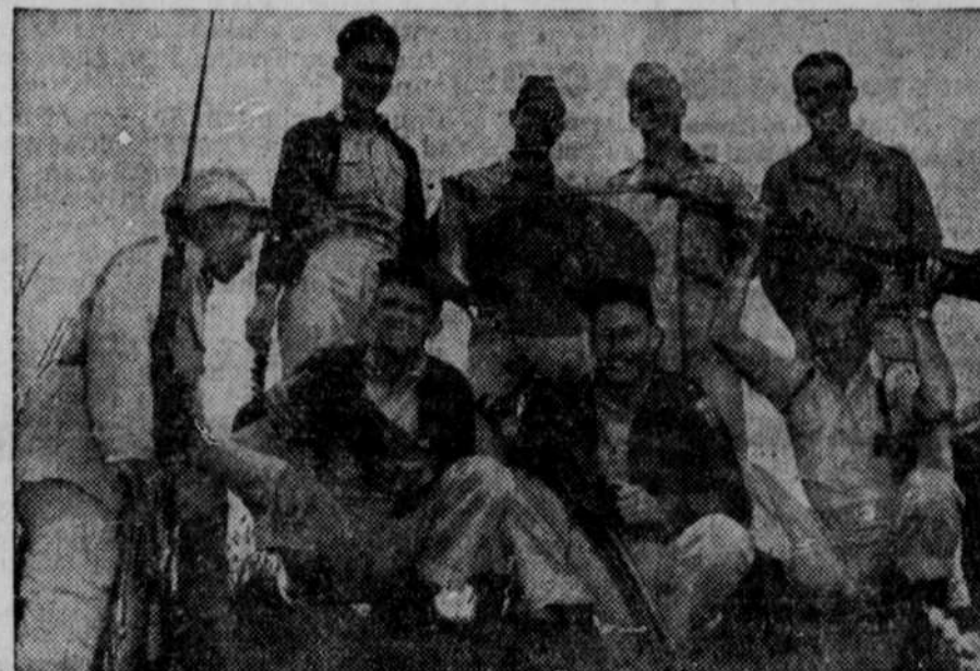
A few of the fighter pilots of the 14th U.S. air force in China who broke up a big force of Jap bombers attempting to destroy the 14th's air field. The total enemy loss was 15 bombers and 2 Zeros confirmed, 7 bombers and 2 Zeros probably destroyed, and 3 bombers and 4 Zeros damaged. The raid was attempted on Japan's "aviation day."