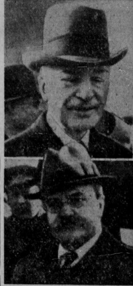
Top: United States Secretary of State Cordell Hull as he arrived in Moscow to confer with Russia's foreign commissar, Vyacheslav Molotov, bottom, and British Foreign Secretary Anthony Eden, on matters pertaining to the war.