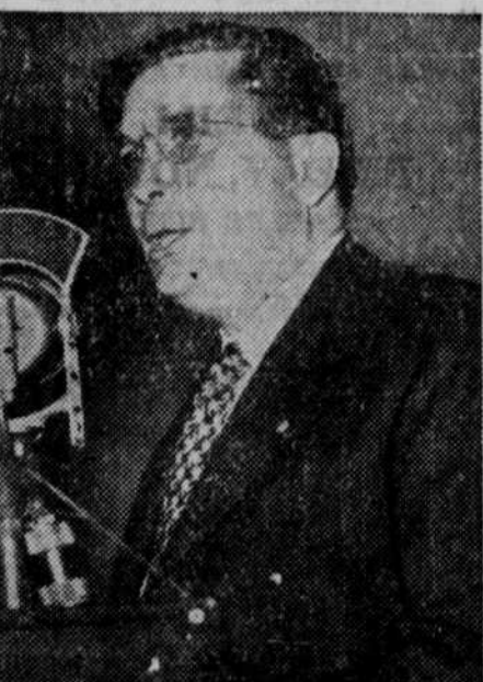
Wendell Willkie, GOP presidential nominee in the last election and a current prospect for 1944, is pictured speaking in St. Louis where he suggested stabilized world currency.