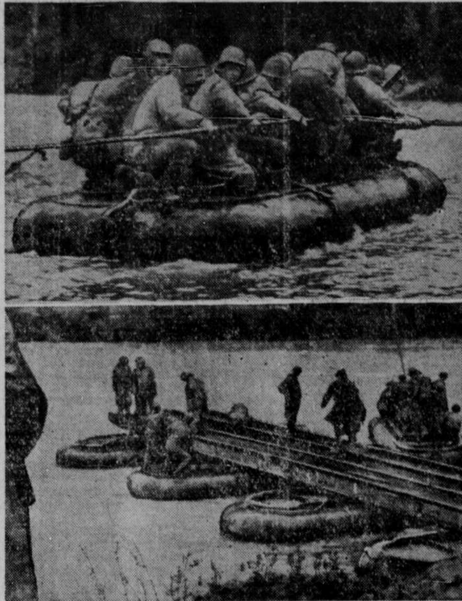
Despite strong German defensive action, Allied forces pushed across the Voltorno river in their steady northward march over Italy. Top: American infantry troops tow themselves across the strategic river on a rubber pontoon. Bottom: A group of American soldiers pitch a steel pontoon bridge across the Voltorno while a sentinel guards against snipers.