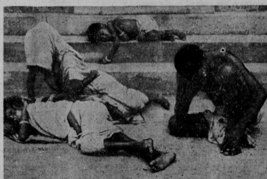
A dying Indian family is pictured on the streets of Calcutta where 250 persons perished daily in the worst famine to strike India for decades. This scene was typical of the condition in India as appeals were made for Allied assistance in the form of "mercy ships" bearing food. The famine was reported to have killed 25,000 in Bengal within four months.