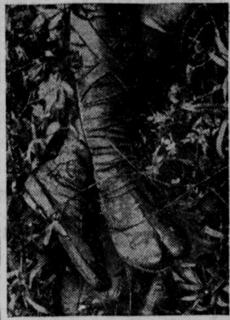
This split-toe type of shoe, pictured on a dead Jap soldier in the Solomons, is worn by those who, as civilians, were accustomed to open sandals fastened by a strap between the toes.