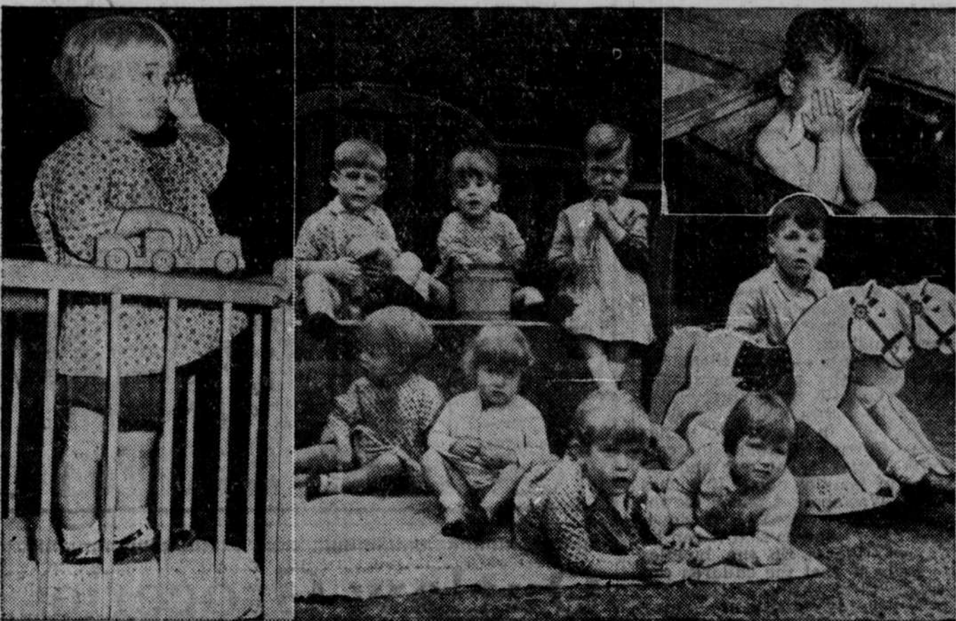
Hundreds of English children whose parents have been killed and whose homes have been destroyed during the war are being nourished back to health and guided in the ways of normal childhood at the Hanover Lodge Nursery in London. Some were so shocked by the noise and destruction of war that they may never recover. Left: One of England's "homeless generation" bravely salutes in her crib. Center: In the garden the children pose for the cameraman. Top right: This modest young man covers his face as he is photographed while being given a bath. The nursery was formerly the home of a wealthy American girl.