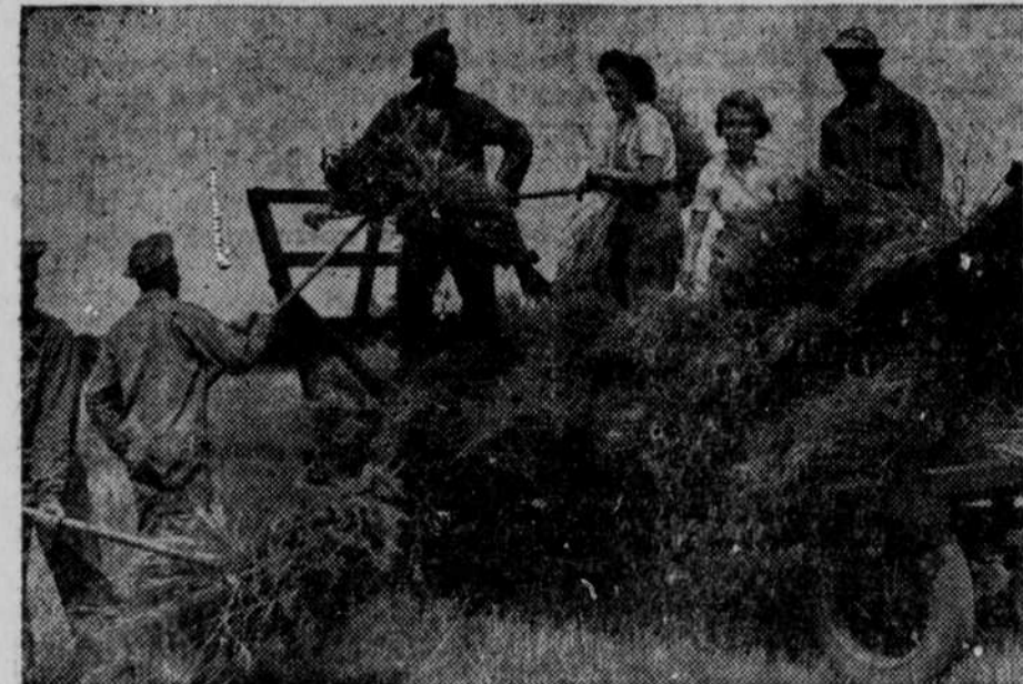
United States soldiers have volunteered to gather the harvest near their camp at Herts, England. Many were farmers before the war and are old hands at handling a pitchfork. English girls are pictured with the Yanks as they gather in the wheat.