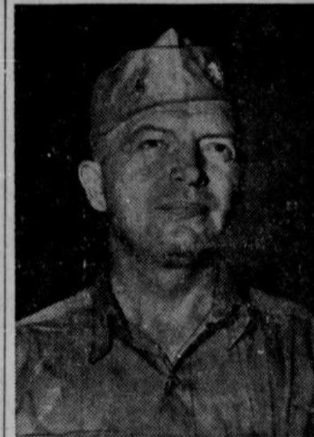
Lieut. Comdr. Harold Stassen, USNR, former governor of Minnesota, who recently became the flag secretary to Admiral W. E. Halsey, commander of the South Pacific force. This picture was taken shortly after Stassen's appointment.