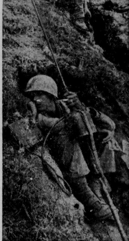
With shells fired by his buddies exploding nearby, this U. S. soldier in Sicily crouches near enemy lines and directs American artillery fire with his walkie talkie.