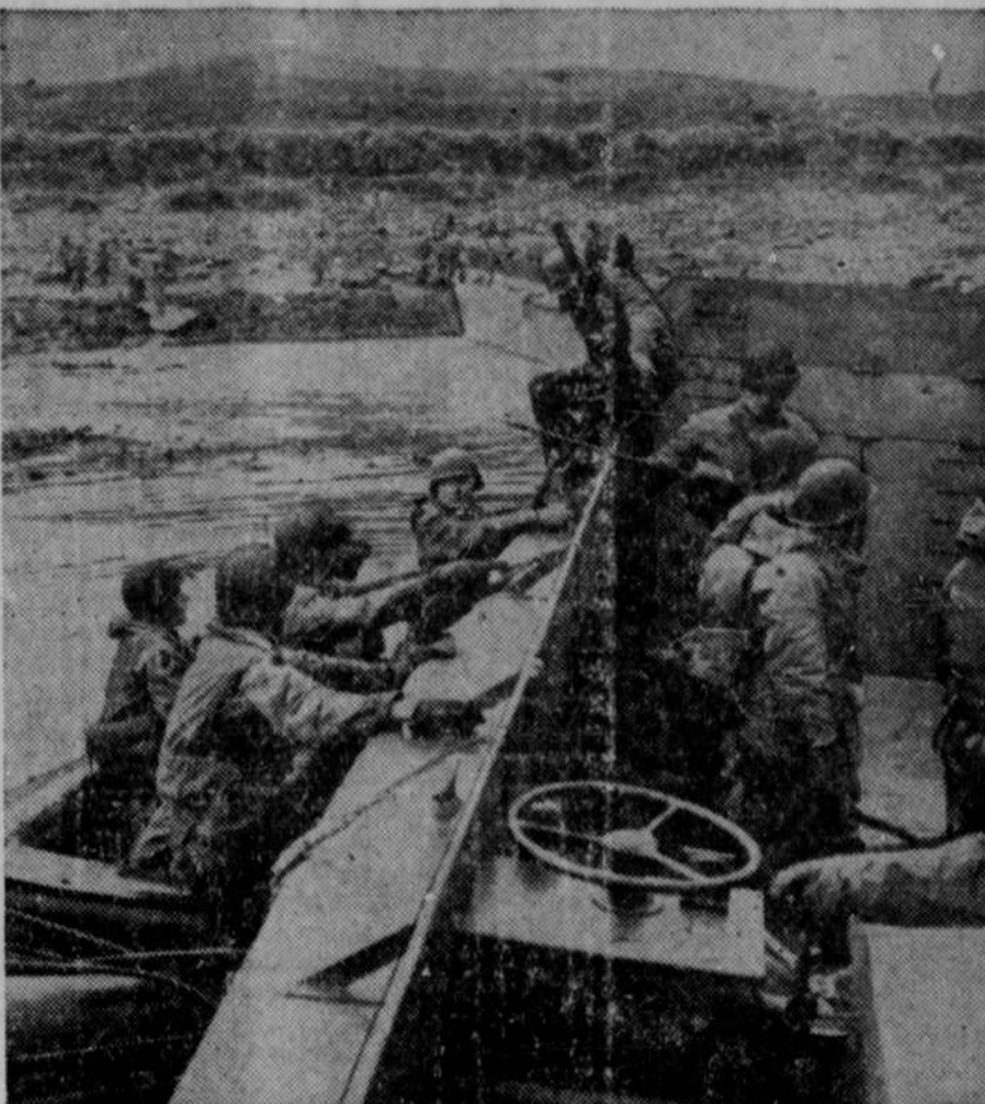
Moving speedily and cautiously, American and Canadian troops are pictured as they neared the island of Kiska on the first day of operations there. They are transferring to a landing craft. The Japanese, in their first such action of the war, made no attempt to defend the island. They fled, allowing the Allies to take it without a battle. According to Vice Admiral Thomas C. Kinkaid, commander of the North Pacific forces, the fall of Kiska puts America in an offensive rather than a defensive position in the Aleutians. This new victory makes the use of land based bombers against Jap bases in the Kurile islands more feasible.