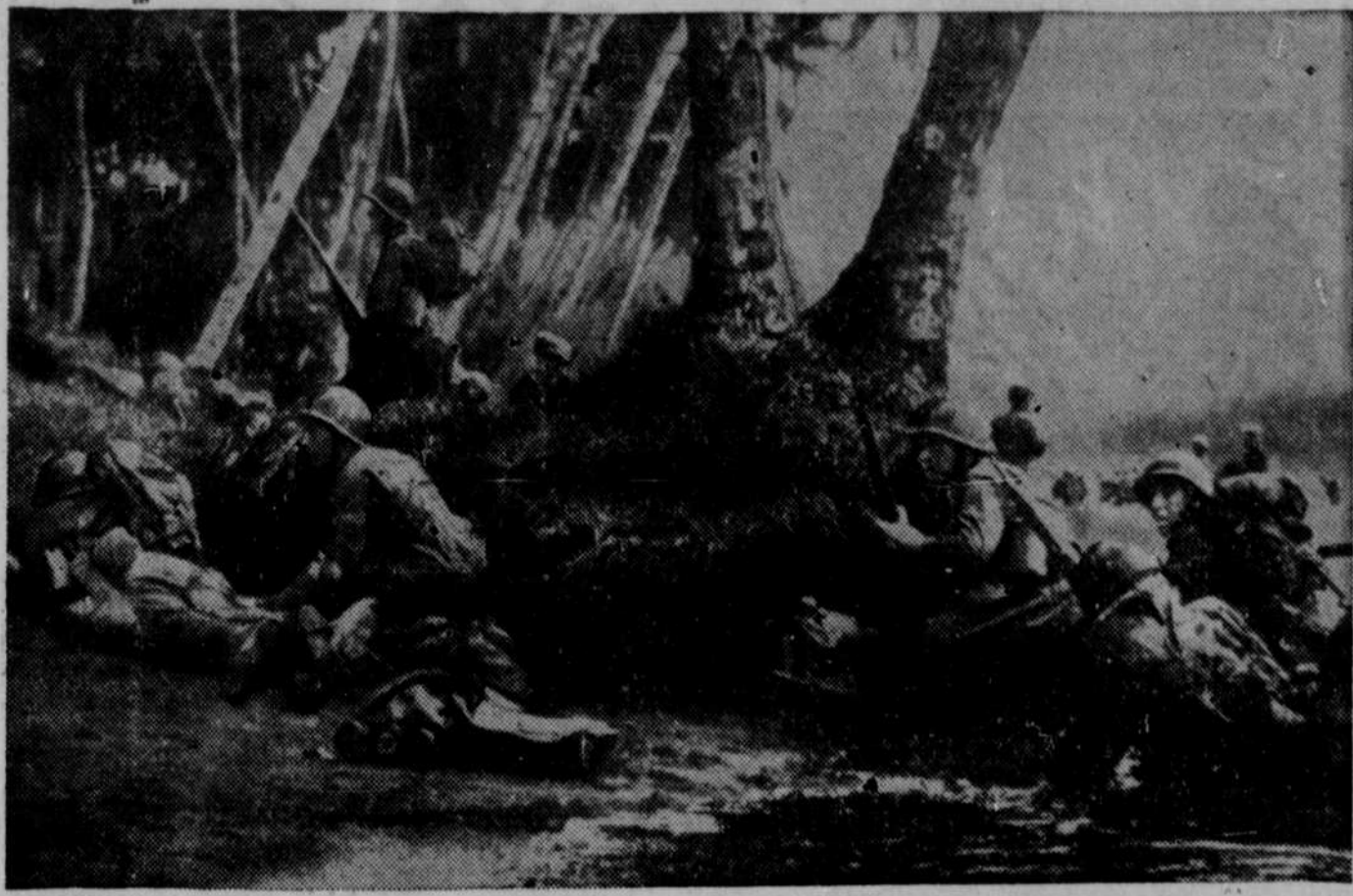
This unusual action soundphoto shows a unit of American fighters attacking on Rendova island despite a heavy downpour. In the dim light of dawn they huddle against tree trunks and other cover. Intensification of the war against Japan on other fronts was indicated by the establishment of an Allied Southeast Asia command under Vice Admiral Lord Louis Mountbatten of Britain.