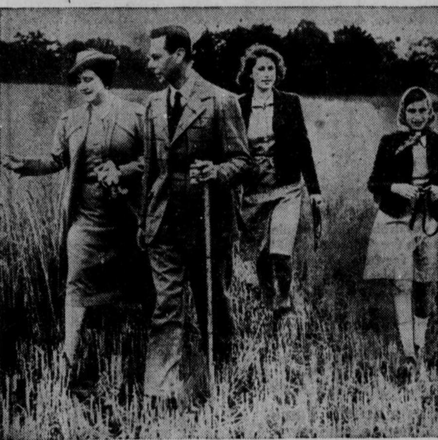
Even King George's private golf course has been plowed up to be used for cultivation under Britain's wartime production policy. He is shown with Queen Elizabeth, Princess Elizabeth (rear left) and Princess Margaret Rose, inspecting the crops being harvested on his former golf course.