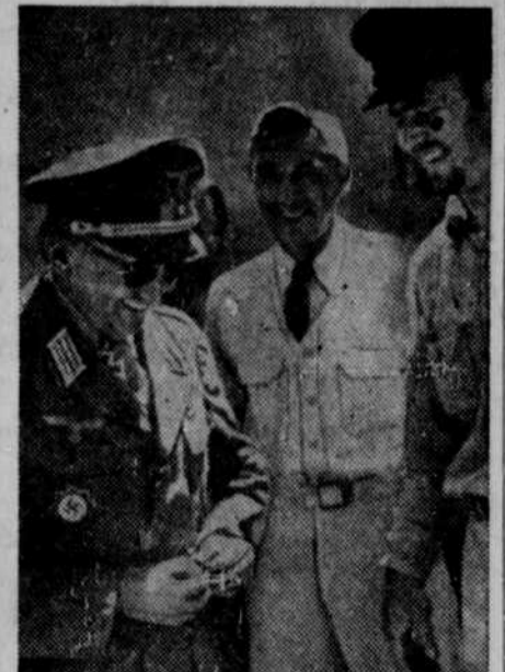
Although vanquished in battle, this German Afrika Korps officer is able to laugh and joke with a United States coast guard and naval officer as he leaves North Africa.

Persian Pastime Medieval Persians used to wager a finger on the outcome of one of their games. The loser would lop off the finger and cauterize the wound.