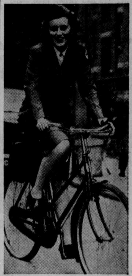
A bicycle is Miss Kathleen Kennedy's mode of transportation as she goes about her duties working for the American Red Cross in London. She is a daughter of Joseph P. Kennedy, former American ambassador to Britain.