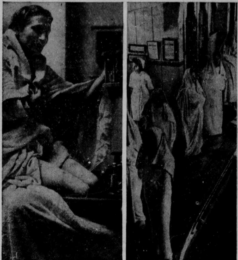
A new British policy for war workers gives them treatment at leading spas. Left: A mother of seven children uses an hourglass to time herself at the Droitwich Springs in England. Right: Wrapped like mummies, these workers are shown at the famed saline baths.