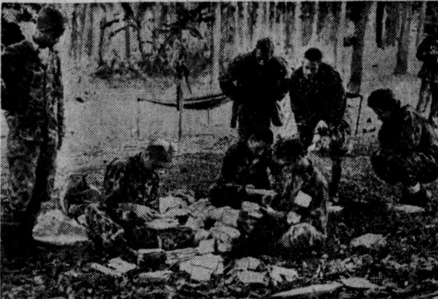
The greatest morale builder among military men—mail from home—is sorted out by men on New Georgia island just before they start out on a trek across mountains, jungles and swamps to surprise the Japs at Viru harbor. Capture of this strategic spot was the beginning of the end for the Japs on New Georgia island and the vital Munda air base.