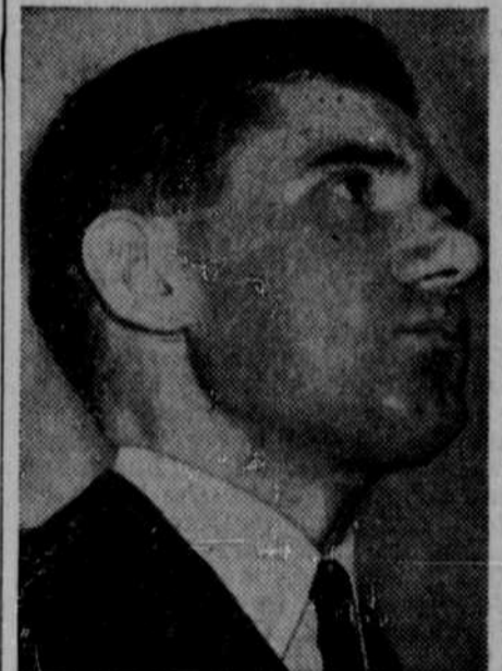
Andry Gromyko, who has been named to replace Maxim Litvinoff as Soviet ambassador to the United States. He has been attached to the Russian embassy and was in charge between Oumansky's recall and Litvinoff's arrival.