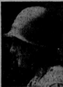
Gen. George S. Patton

Thirty-eight days after the first Allied troops set foot on Sicily's southeastern shore, the island fell, with 140,000 Axis prisoners reported captured. As Gen. George S. Patton's Doughboys from the Seventh American army swept into Messina to take over the enemy's last stronghold, the Italian mainland loomed two miles away.