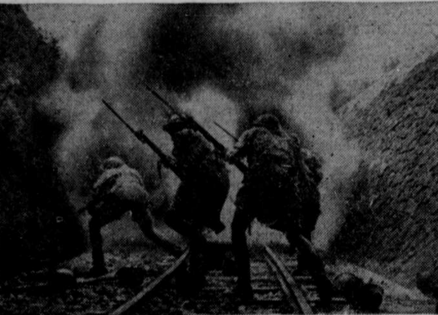
Sicily's fall came only after stiff fighting such as this, in which British Tommies from the Eighth army advanced through a railroad siding under heavy fire.

(EDITOR'S NOTE: When opinions are expressed in these columns, they are those of Western Newspaper Union's news analysts and not necessarily of this newspaper.) Released by Western Newspaper Union.