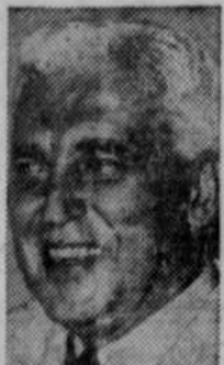
Paul V. McNutt

In an effort to provide industry with necessary labor, the War Manpower commission headed by Paul V. McNutt laid down new regulations for Selective Service, making occupation rather than dependency the basis for deferment.