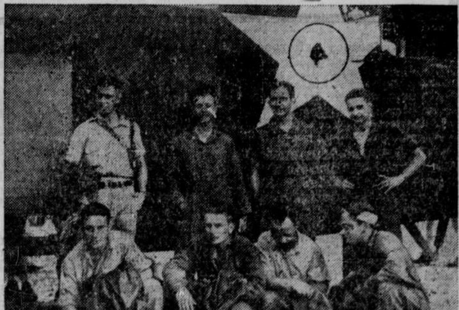
Officers and crewmen of a Liberator B-24 bomber are pictured beside their plane somewhere in the Southwest Pacific shortly after raiding a Japanese base at Gasmata, New Britain. A Jap Zero pilot scored a bullseye through the center of the bomber's marking star but failed to bring the plane down. Four other heavy bombers took part in the raid.