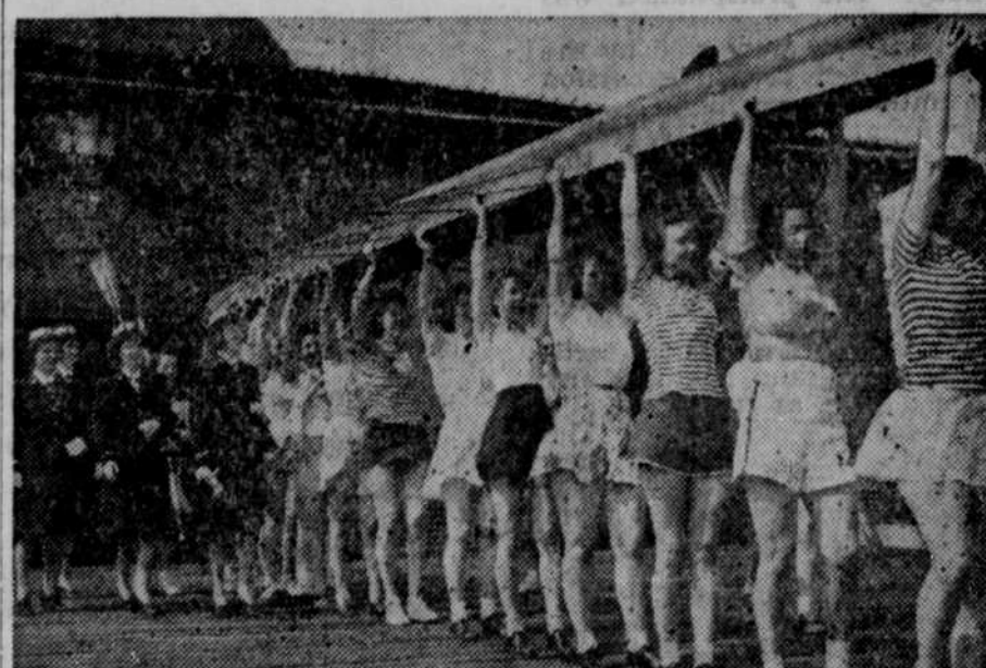
The historic Charles river in Cambridge, Mass., where Harvard masculine crews practiced and raced for many decades, is now the scene of a training headquarters for WAVES. A group is shown carrying their shell from the boathouse. They learn to row, handle a small boat, and other water lore.