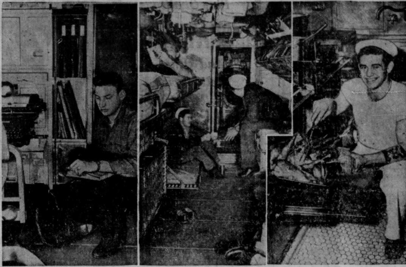
The USS Cuttlefish, a modern submarine, was built to provide comfortable quarters for its crew as well as to raise havoc with the enemy. Its facilities include a reception room, shower, and radios used solely for amusement. At left, a yeoman keeps records in the sub's office. Those records show that the Cuttlefish has sunk one Jap warship and three Jap merchant ships although it was launched very recently. At center is the crew's quarters, and at right, the cook smiles as he prepares turkey for dinner. The spacious engine room and other compartments of this sub belie the visions of cramped living conditions so often associated with submarines. The Cuttlefish is powered with Diesel engines and has the latest safety developments in its escape hatch.