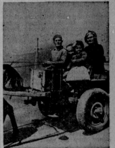
With the Axis cleaned out of North Africa, refugees like the ones shown above can move back into their homes. These people are returning to Bizerte aboard their carriage which is fitted out with springs, rubber tires, and a wheel assembly from a Rolls Royce automobile.