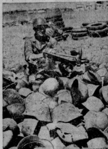
Apparently Axis troops are using one-legged men. An American soldier is shown examining an artificial leg which was left on a Tunisian battlefield by some German or Italian soldier who is literally on his last leg. Artificial limbs are a rarity on a battlefield where men are assumed to be in perfect condition.