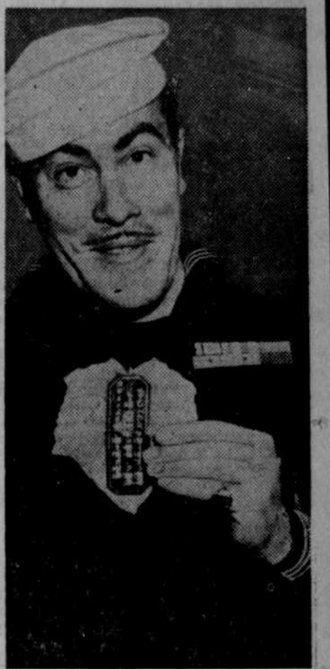
"You guys better get out of here while the getting's good." That's what the characters on this imitation leaf told the Japs on Kiska Island. The leaves were dropped by U. S. aviators to enemy forces who are supposed to have an aversion for the leaves, supposedly from a Japanese Kin tree.