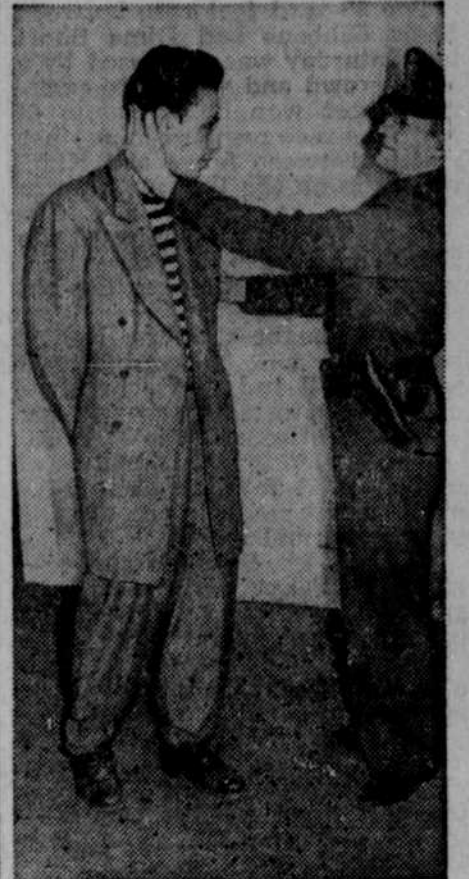
Servicemen and zoot suit wearers fought a small war of their own in Los Angeles, sending many youths like the one above to jails and hospitals. The servicemen were stripping the "zooters" in revenge for previous assaults.