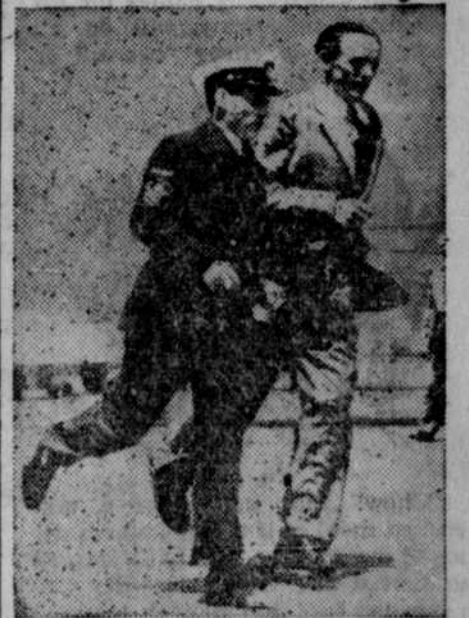
Gunder Haegg, Swedish distance runner, limbers up with Greg Rice, America's speediest two miler, after Haegg arrived in New York for the National AAU championship track meet.