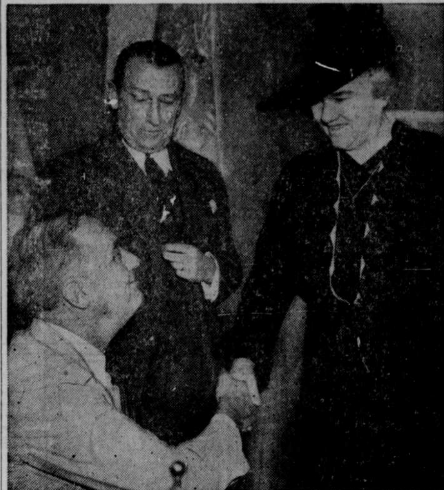
President Roosevelt meets a famous Australian nurse, Sister Kenny, who has developed a new method of treating infantile paralysis. Floured above are President Roosevelt, Basil O'Connor, head of the National Paralysis Foundation, and Sister Kenny. She was a luncheon guest at the White House.