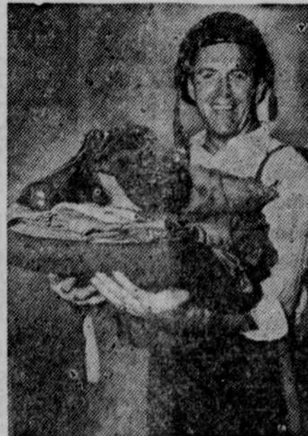
Private Terry Moore, formerly an important member of the St. Louis Cardinals ball team, is shown with his equipment just after being sworn into the army air forces in the Canal Zone.