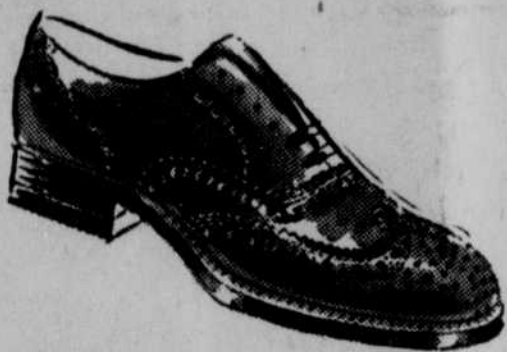
WELL-BUILT DRESS SHOES FOR MEN!

Comfortable open-toed unlined ghillies; tailored spectators for business and semi-dress; comfortable elasticized pumps for dressy comfort; and open-toed black gabardines for special occasions.