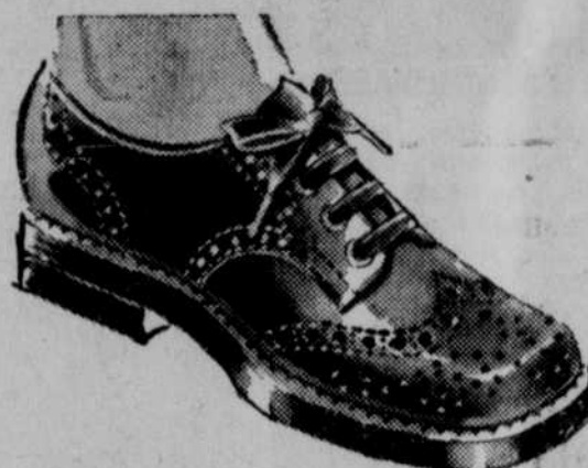
STURDY ONES FOR THE YOUNGSTERS!

Bal Oxfords with side-leather uppers... and wing-tip and moccasin-toe styles. Dependable Goodyear welt construction. Convincing reasons for choosing Penney shoes.