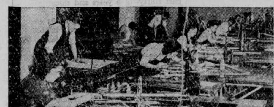
Here the completed chart is engraved on a permanent copper plate before being sent to the photographer and printer.