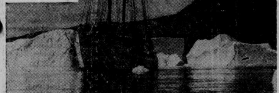
U. S. S. Bowdoin, one of the most famous exploration ships, which is still in service.

Each month more than two million charts roll off the presses of the United States Hydrographic Office, giving detailed, vital data of the harbors and expanses of the seven seas. As these charts go out to the fleet and to friendly mariners of the United Nations, U. S. Navy ships are charting new segments of the oceans, new ports of call, new reefs and channels. Likewise, old and incomplete charts are constantly being brought up to date. The chart data obtained by hydrographic engineers aboard ship are sent to the navy's Hydrographic Office where, under the direction of Rear Admiral G. S. Bryan, USN, the Hydrographer of the Navy, they are plotted, processed, printed and distributed.