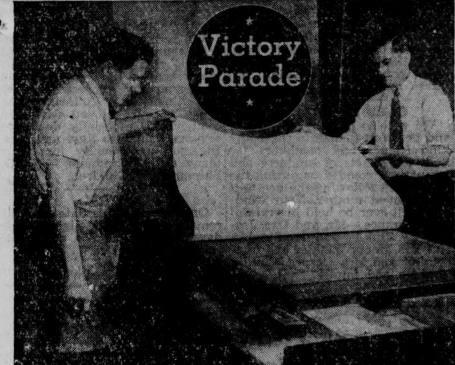
Once the chart is on zinc, technical workmen see that the design is clear-cut and that the zinc plate receives proper chemical treatment. Before the zinc plate goes to press a proof copy is pulled.