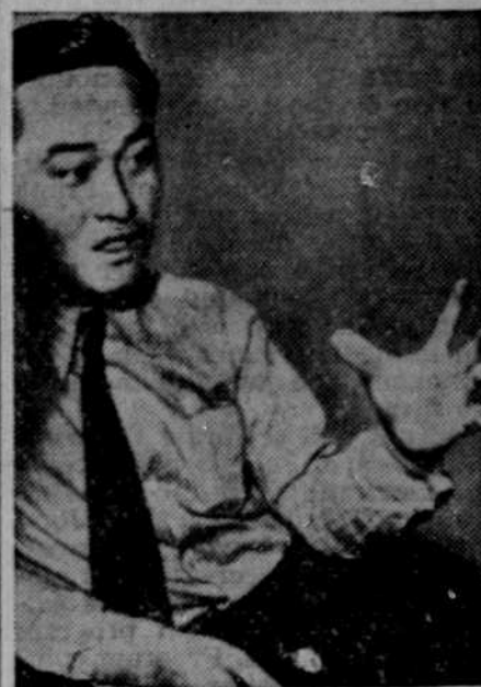
Fish and rainwater was the complete diet of Poon Lim, this 25-year-old Chinese sailor, while he drifted on the Atlantic for 131 days with only a raft between him and Davy Jones' locker. His ship had been torpedoed.