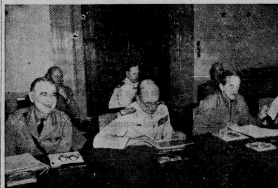
Three of Britain's war leaders take their places across the table from the United States war chiefs at a meeting of American and British war strategists in Washington, D. C. Left to right: Lieut. Gen. Sir Hastings L. Ismay, chief staff officer to the minister of defense; Admiral Sir Dudley Pound, first sea lord and chief of naval staff; and Gen. Sir Alan Brooke, chief of the imperial staff.