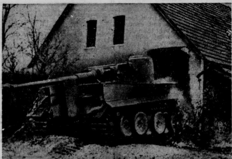
A Nazi Mark VI tank is shown plowing through a house in this photo from a German propaganda magazine. This is one of the very few good pictures of this tank to reach America. Most of the other pictures show the tank after it has tangled with Allied equipment, been knocked out of action, damaged, and captured. Note here that its long high velocity gun is turned back over its tail to avoid injury.