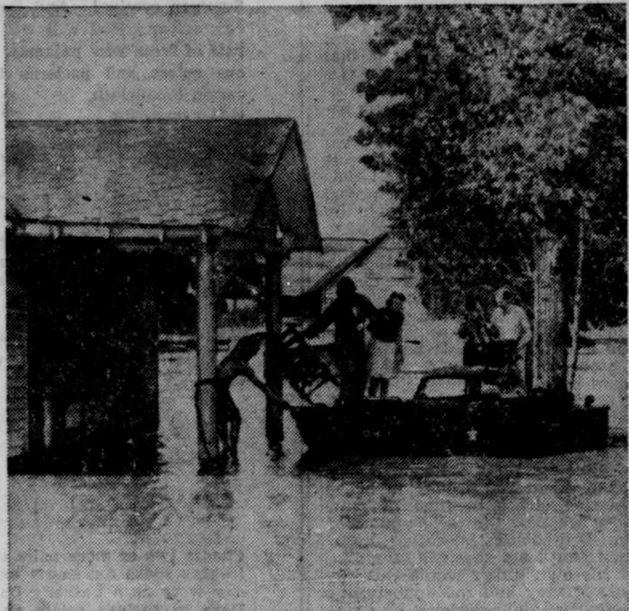
When the White river in Arkansas broke its banks and flooded the adjacent country, United States army engineers came to the rescue. This photo shows an amphibious jeep driving up to a front porch to rescue a family of flooded-out residents. The top of a partially submerged automobile may be seen over the edge of the jeep.