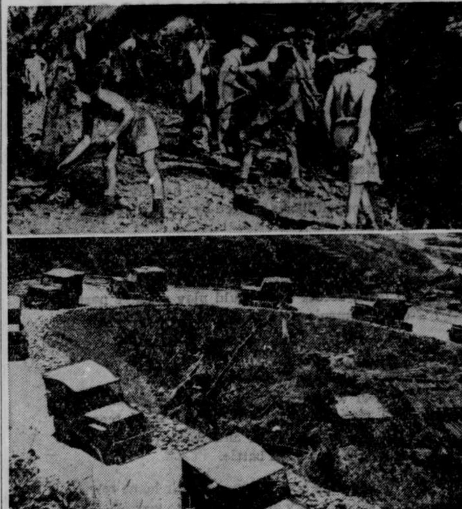
British engineers in Burma are hacking highways through jungles, mountains, to create a system of roads and supply lines over which they plan to force the Japanese from their positions in that sector. At top: British troops are working on a new stretch of road. Below: A convoy of jeeps carry supplies around a loop on a new road in Burma.