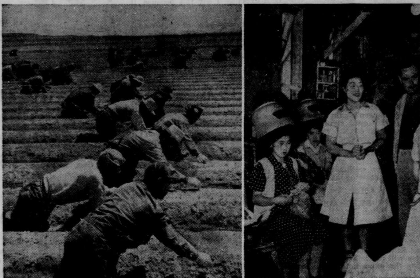
Two pictures of the activities being carried on at the Japanese relocation center at Tule Lake, Calif. Left: These older Japanese men are busy weeding onions for the large truck farm maintained at the center. Right: A small section of one of the several large, modern, well-equipped beauty salons at the center. Hair cuts here cost only 20 cents. In discussing the relocation problem, Roane Waring, national commander of the American Legion, stated that he believed the army should manage Japanese relocation centers.