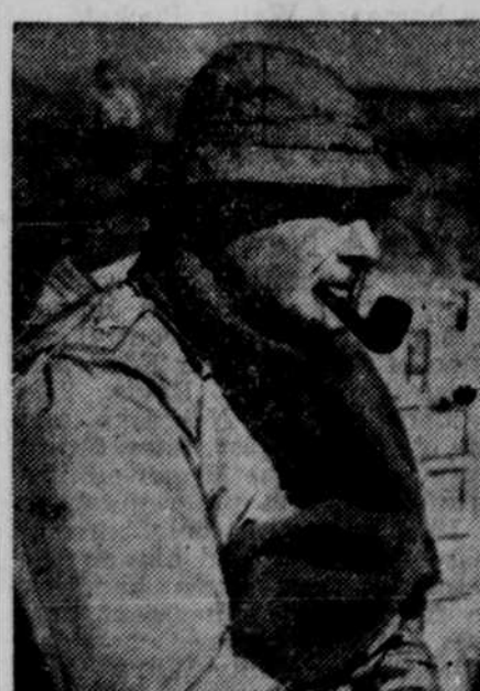
Maj. Gen. Eugene M. Landrum, pictured in his working clothes, was named commander of all U. S. army troops on the island of Attu by Secretary of War Henry L. Stimson.