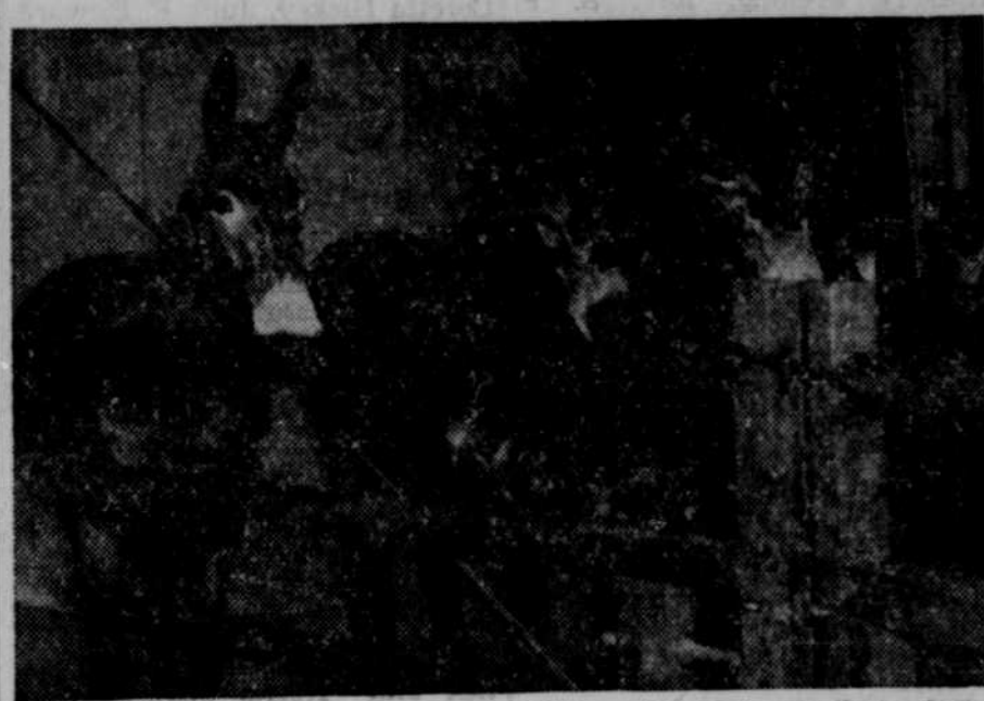
Despite mechanization, the army needs the lowly mule. These three have been picked from a mule market in St. Louis, Mo., to be transported to a branch of the armed service. The demands of military forces have caused prices on mules to soar and there is a brisk rush of trading each day for this cross between a jackass and a mare.