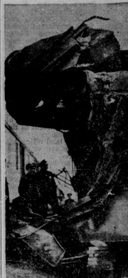
"Excessive speed" was named as the cause of a wreck of a Pennsylvania train, New York bound from Atlantic City, killing 14 persons and injuring 89 others at Delair, N. J. The wrecked vestibule looks like a grim jaw ready to devour the inspecting officials.