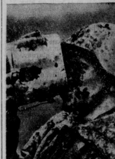
This front cover of a Nazi propaganda magazine which devoted an entire issue to the mud and water in Russia shows a German trooper taking a drink of muddy water.