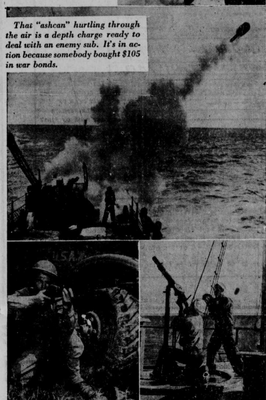
When you bought a $100 war bond you may have bought a Ga-

A $100 war bond buys 2,000 rounds of steel-jacketed .30 calirand rifle for a fighting American. ber shells for this naval gun.