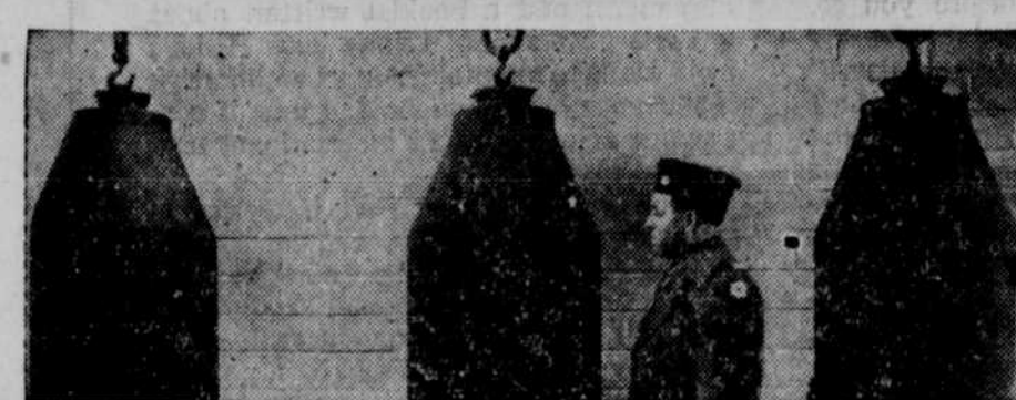
These, brother, are 2,000-pound block-busters for Adolf and his helpers. They cost a lot, $600 each-$800 in war bonds.