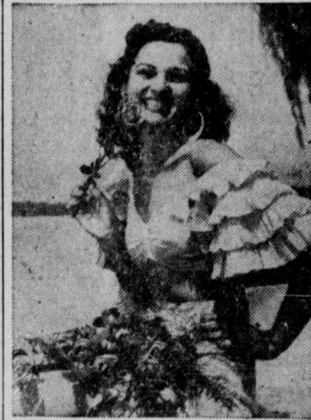
Be-ruffled, but unruffled, smiling Kathleen Turner poses royally with an "Editor McFarland" rose, after she had been selected Florida's rose queen at Cypress Gardens, Fla.