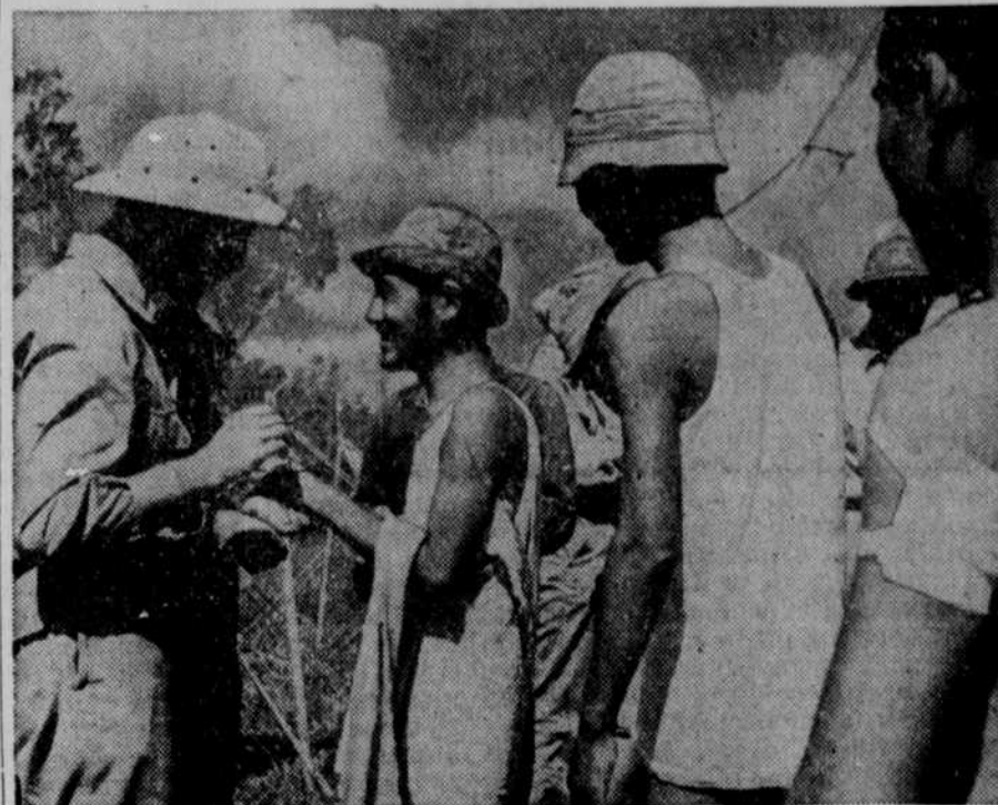
Japanese prisoners of war are shown being given medical treatment by a U. S. officer at a South Pacific prisoner's camp. Smile on prisoner's face seems genuine enough.