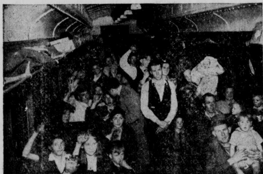
As partial solution of the farm manpower problem, farm families are being transported from so-called "submarginal" low-production farms to areas where production is high. Picture shows men, women and children arriving in New York en route to the truck farming region around Stamford Springs, Conn. Camp Connors, former CCC camp, will house them.