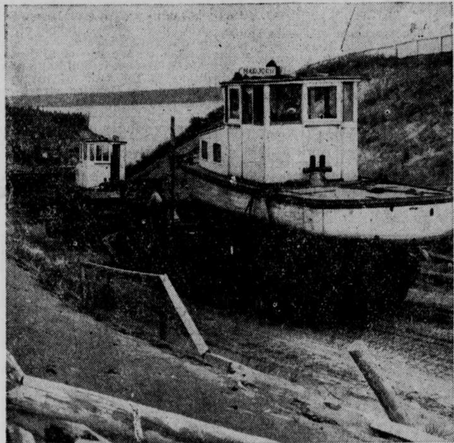
In transporting pipe and other supplies for a pipeline connecting the Norman oil fields of Canada with White Horse, on the Alaskan highway, to make fuel easily available for defense stations, U. S. army engineers overcome great obstacles. Here a convoy of supply barges and towing craft nears the end of a rough 16-mile cross-country voyage.