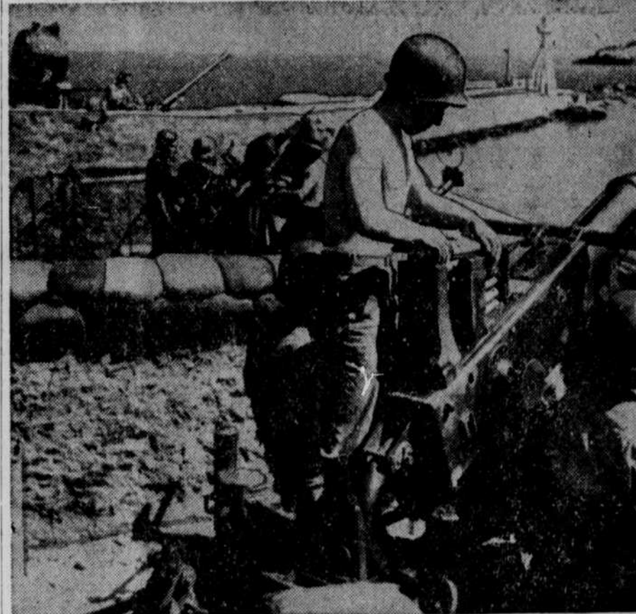
Anti-aircraft gunners of three United Nations are seen working side by side as they protect an Allied-held North African port from Axis air attacks. In the foreground an American unit mans a Bofors gun, while just behind them is a French crew servicing their Oerlikon gun. In the far background is a British crew with another Bofors.