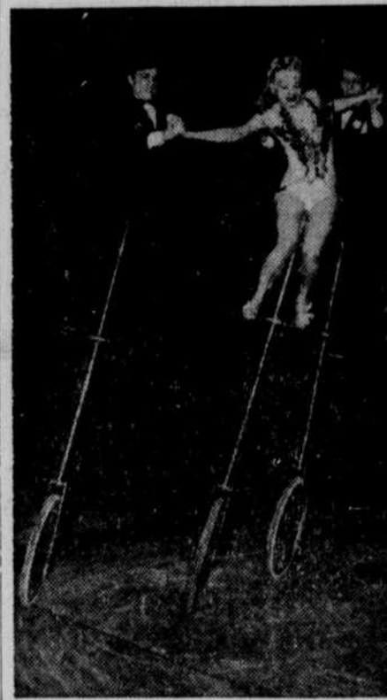
Ladecz and gentlemen! Your kind attention, please! You are now about to witness the world's greatest bicycle act! Yes, the circus has come to town, surest proof that spring is here to stay. The Shyrettos, famous bicycle and unicycle trio, are pictured in action under the big top in New York.