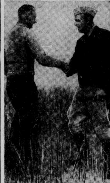
Gen. Dwight ("Ike") Eisenhower (overseas cap) shakes hands with British General Bernard Montgomery, commander of the Eighth army which chased Rommel from Egypt halfway up Tunisia. General Eisenhower flew to General Montgomery's headquarters to congratulate him and his men for cracking Nazi resistance.