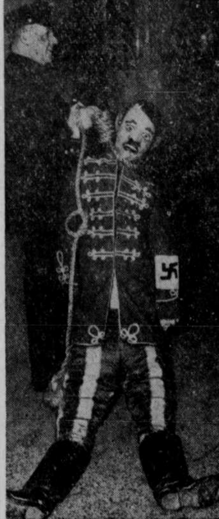
Imagine the cab driver's surprise when he found Adolf Hitler as a passenger in his car when he came out of a luncheon in New York. The cab driver called a policeman, who quickly took Hitler in tow.