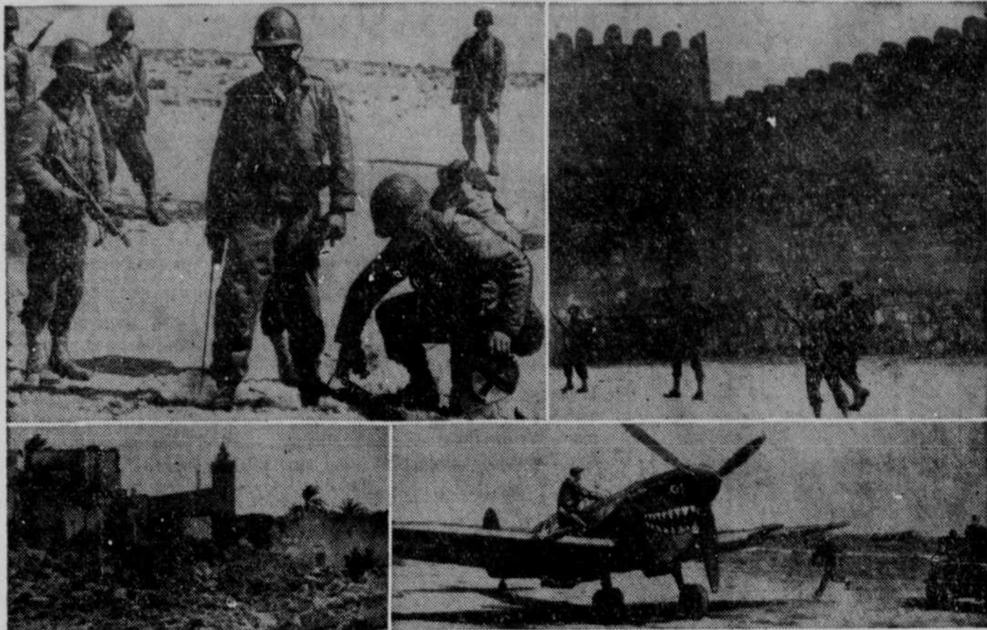
In picture at upper left an American sapper (kneeling at right) holds an Axis mine which he has just dug from the sand near Gafsa, Tunisia. Upper right: On the hunt for snipers, a U. S. security unit searches the ruins of an old fortress in Gafsa. Below, left: Through rubble-filled streets and past the bomb-blasted buildings of Gafsa march U. S. troops, meeting no resistance. When the call comes to go aloft, U. S. pilots are rushed out to their airplanes in jeeps. In picture at lower right one of the airmen is running from the jeep to his sky fighter.