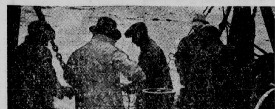
At sunset fishermen mend nets torn by rocks on the ocean floor.