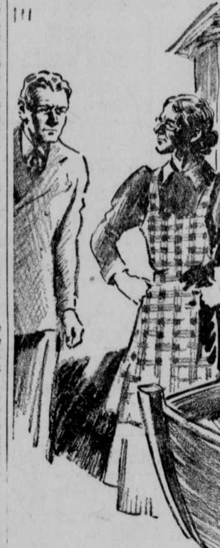
"You sick. Mr. Norcross?"

back of another picture. It didn't matter. The thing was not to miss anything outside.