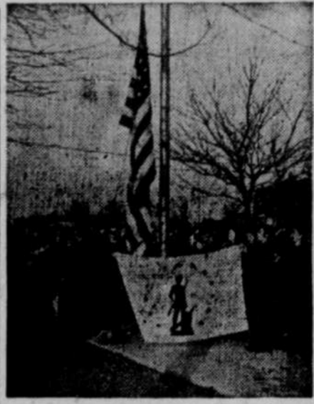
Battle Flags of the Schools

The Frontier, February 22, 1923. O'Neill has dropped into an epidemic of the "flu" or something similar. Most of the cases are of a mild form, however, and are