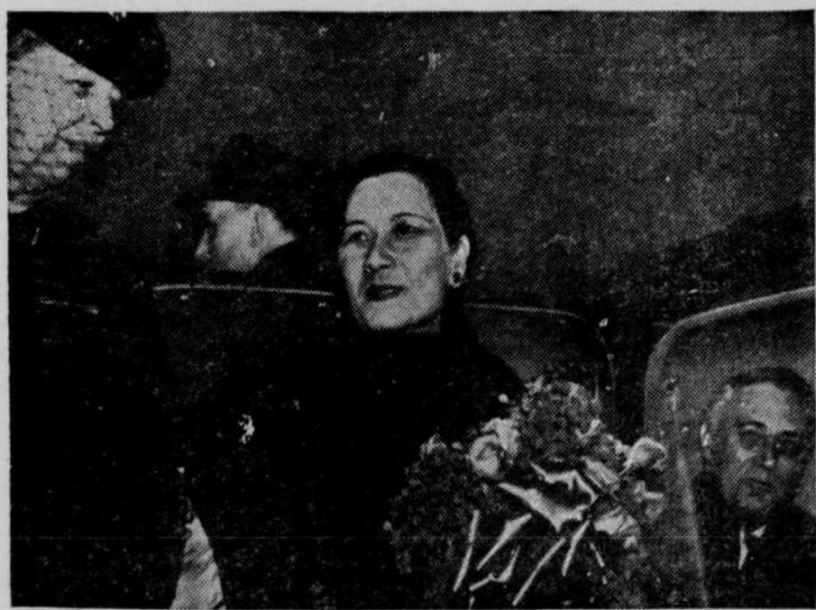
Madame Chiang Kai-shek, first lady of China, is shown on arrival in Washington to be a guest at the White House. President Roosevelt and his wife greeted the distinguished guest, who later addressed a crowded congress. Admission was by ticket.