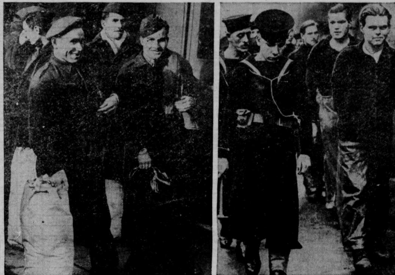
The brighter side for enemy soldiers is to be taken as war prisoners, as is apparent in this picture. Shown on the left are smiling Italian prisoners who realize that the war and all its horrors are over for them. They are on their way to a prison camp for the duration. On the right, German prisoners from a U-boat don't seem to be too unhappy over their plight. Perhaps they are thinking of food, shelter and comparative safety.