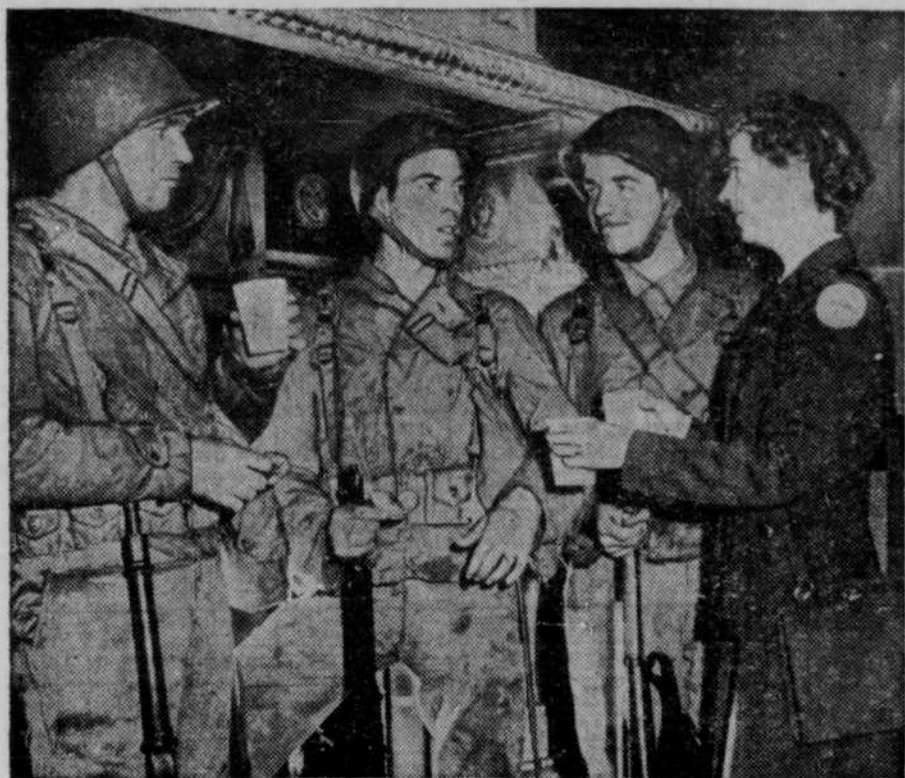
Three Yankee doughboys, just returned from field duty, are served coffee and doughnuts by Mrs. Theodore Roosevelt, wife of Brig. Gen. Theodore Roosevelt, in the American Red Cross club in London. She is a daughter-in-law of Former President Theodore Roosevelt. Needless to say the boys relished the handout.