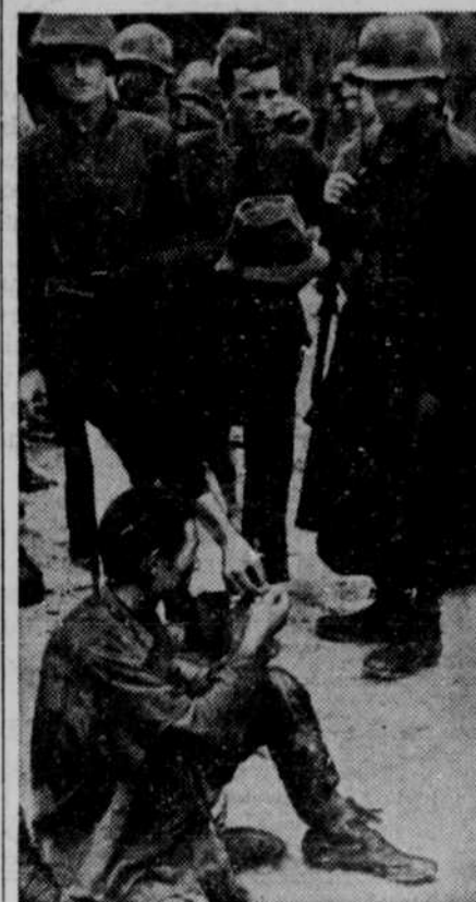
First it was the Chinese who was held prisoner by the Jap. Now he has been freed, and the Jap is held prisoner. Here the Chinese lights a cigarette for his erstwhile captor.