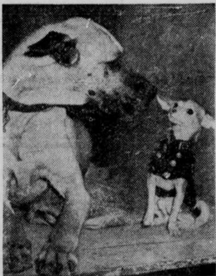
A study in canine contrasts at the opening of the Westminster Kennel club show in New York. The big dog is a Great Dane, Dino Xanthippi. The half pint is Thein's Little Man II, a Chihuahua, and weighs only about a pound.