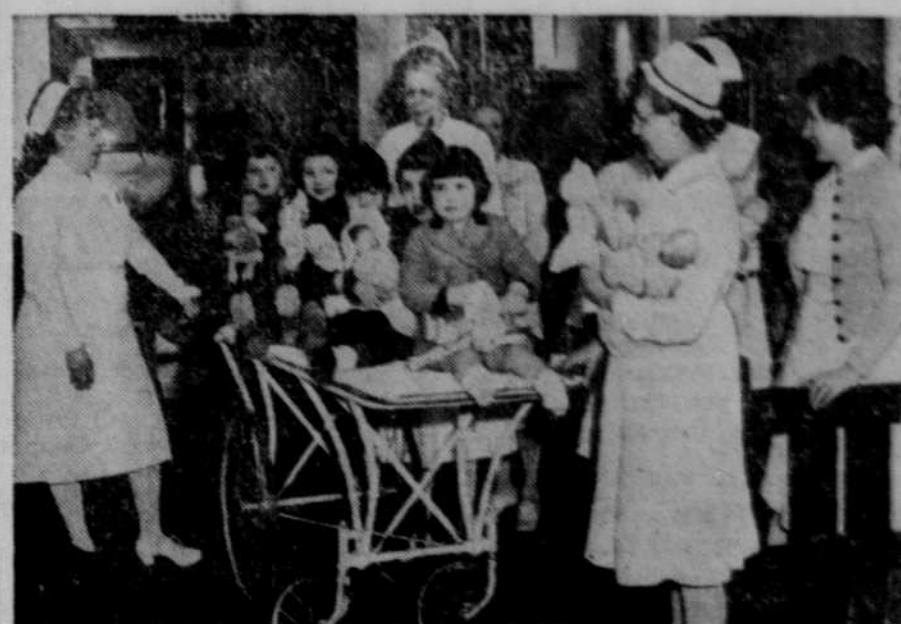
With severe cuts in fuel rations of non-residential users in eastern states bringing supplies to about 45 per cent of normal, the Neponset children's hospital at Rockaway, N. Y., was emptied of its little patients so the hospital could be closed. Bedridden evacuees are shown being carried from the hospital.