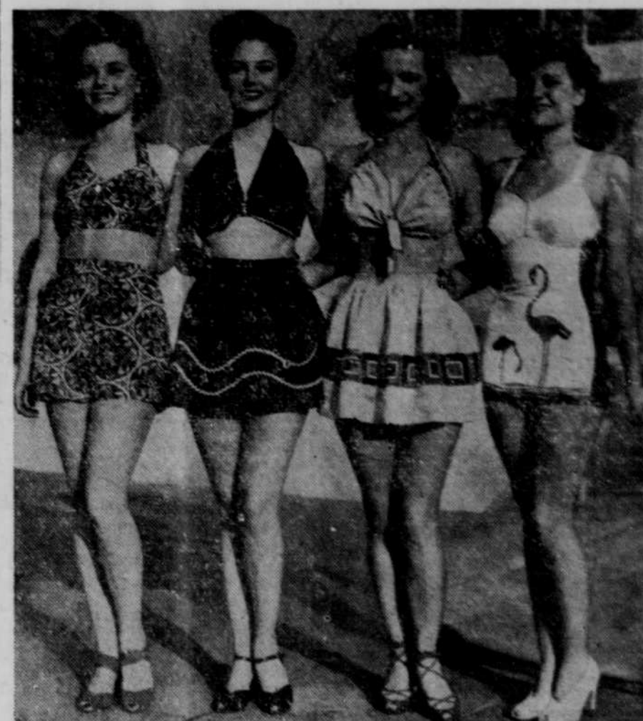
Just to remind you that somewhere in the world the sun is shining, and that it'll be shining on you, too, some day, presented here is a preview of what the well undressed mermaids will be wearing on the beaches next summer. This preview took place at Los Angeles, where it is summer most of the time.