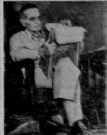
Adm. William F. Halsey predicts complete victory over the Axis in 1943. He warned the dictators, "We are just starting now." Of Tojo, he said: "You started something which will make you wish you had died when you were a baby." Admiral Halsey is shown above, in his new quarters in the South Pacific.