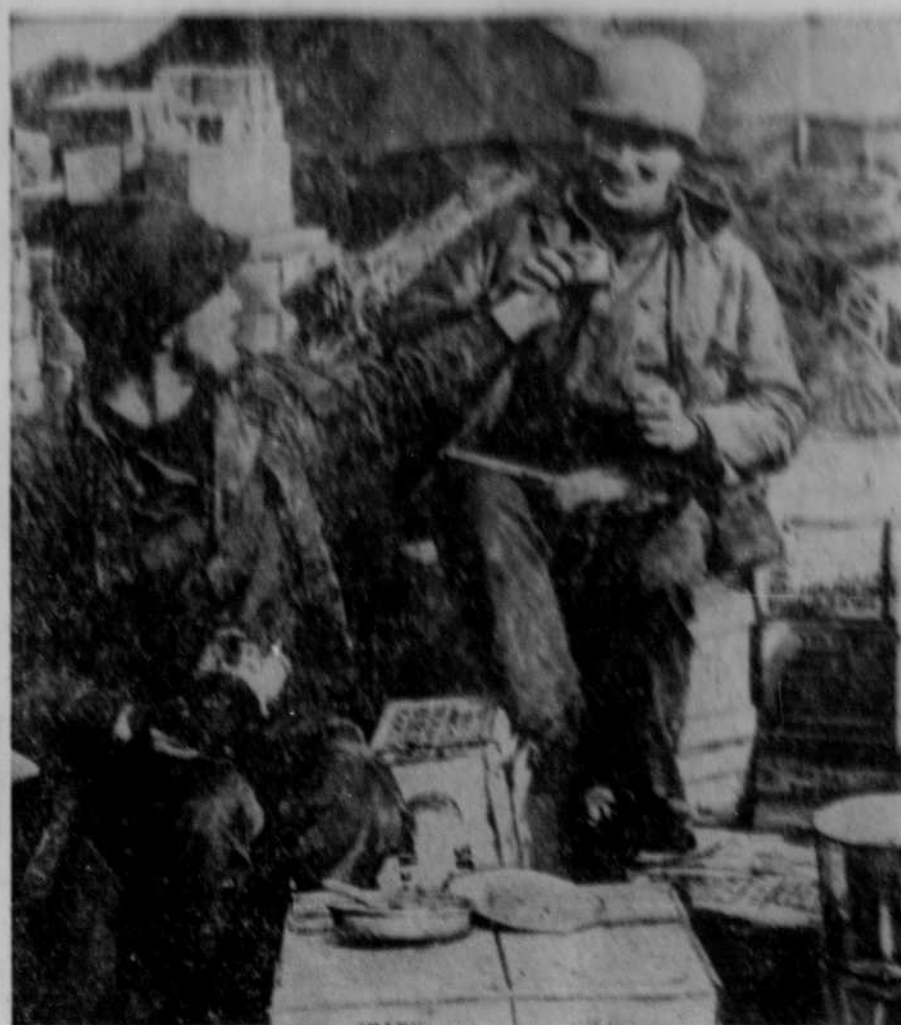
Alaskan scouts dine outdoors in season in the Aleutian Islands. "In season" means when it isn't raining there. For a warm current in the Pacific (we used to call it the Japan current) keeps snow and frost from the bleak islands, but it encourages rain—and how! Here one of the scouts passes a piece of cherry pie to his pal.