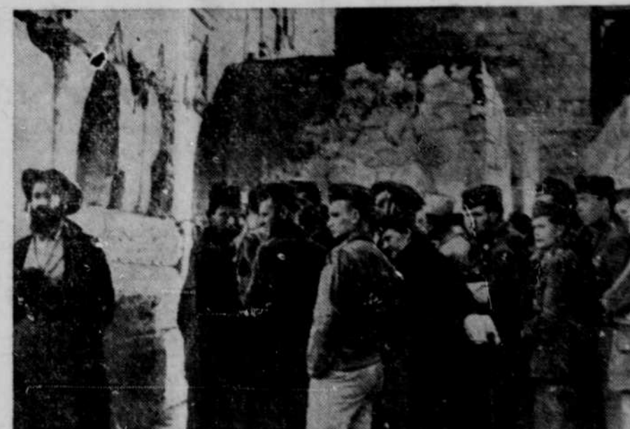
Taken on a tour of the Holy Land by the hospitality committee of the Jewish agency for Palestine, these American soldiers are shown at the famous wailing wall in Jerusalem, the only existing relic of Solomon's temple. They are watching a bearded "chassid" (left) devoutly saying his prayers.