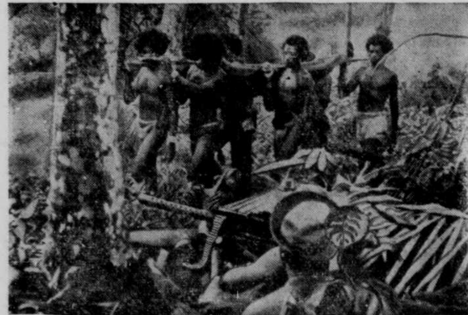
Natives, who know New Guinea territory even better than the jungle-hardened Aussies and Americans, carry the wounded past a machine gun nest. Transporting the injured from the line of battle is merely one important function of these dark-skinned men and boys who act as porters, guides and carpenters.