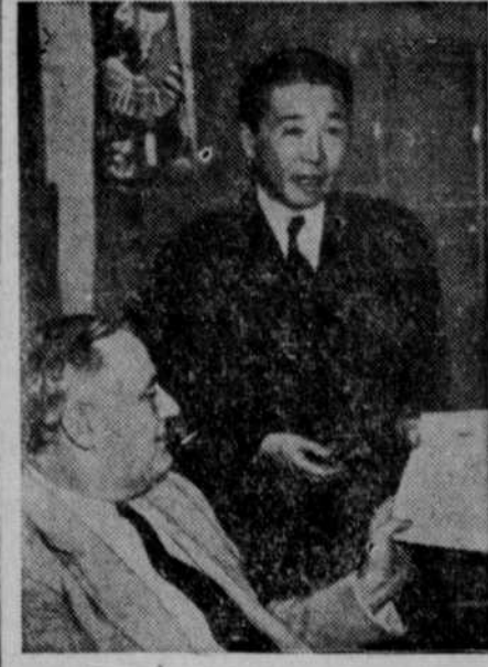
President Roosevelt is shown handing a letter to the Chinese ambassador, Tao Ming Wei, which he wrote longhand to Generalissimo Chiang Kai-shek, and which was transmitted by radio telephoto as the first facsimile sent to China over the new radio photo service between America and China. Time for transmission to Chungking was about an hour and a half. The President spelled "generalissimo" with two "i's," but the error was detected and corrected.