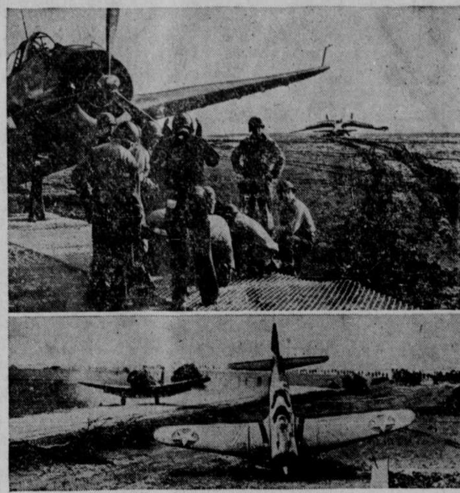
The airport at Safi, French Morocco, offered hard going for navy planes which landed as the field was captured from the French. In picture at top, men are laying a metal strip for takeoff of the torpedo bomber before which they are working. These metal strips have since played an important part in Allied air operations in Tunisia. Below: A navy dive bomber lies nose-down in a ditch near the Safi airport. Another takes off, using the roadway for a runway.