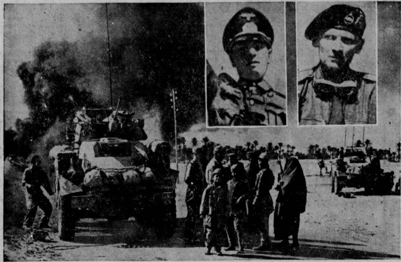
Britain's eighth army has been hard on the heels of Gen. Erwin Rommel's much-vaunted Afrika Korps, pushing them westward towards Tripoli. Photo at left shows local Arabs, friendly to the once-again-invading British army, gathered around British armored cars when the British occupied a wrecked town in the Libyan desert. Dense smoke from a burning tank fills the background. Insets: Left, General Rommel, leader of Axis desert forces, and Lieut. Gen. Bernard Montgomery, commander of Britain's eighth army.