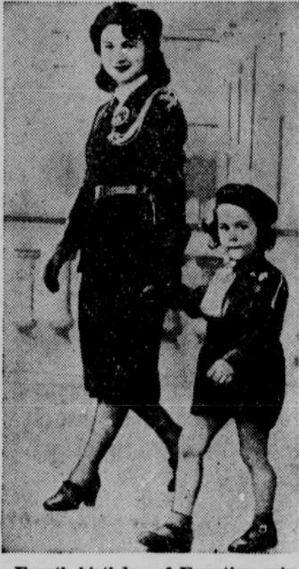
Fourth birthday of Egyptian princess, Ferial, was a happy one. Ferial is shown with her mother, Queen Farida, in their girl guide outfits on the palace balcony, where they reviewed a birthday parade by that organization, which is similar to our Girl Scouts.