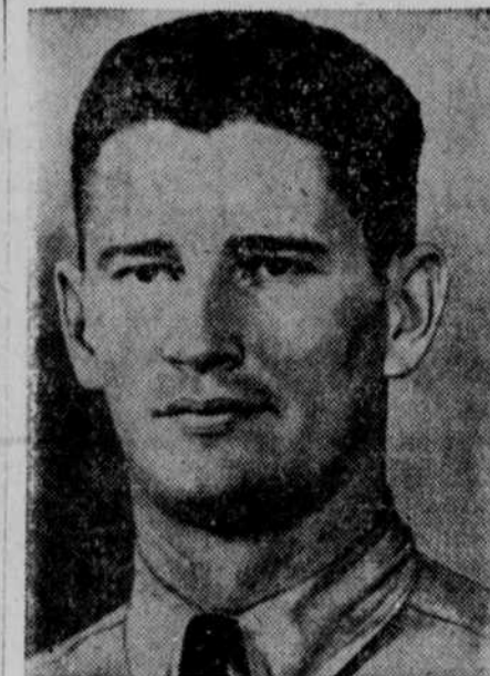
Capt. Joe Foss, 27, of Sioux Falls, S. D., who is the champ of all aces stationed on Henderson Field, Guadalcanal. Foss has shot down 22 of the 450 Jap planes bagged at this base.