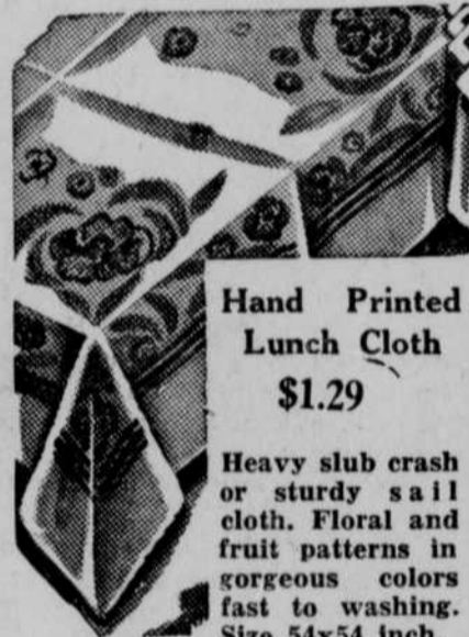
Hand Printed Lunch Cloth $1.29

Remarkable value at this price. 100% wool filled with scroll stitched top. Choice of assorted colors. Choose now.