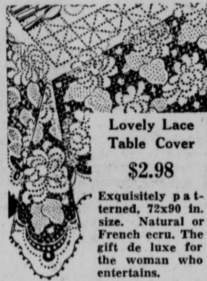
Lovely Lace Table Cover $2.98

Exquisitely patterned. 72x90 in. size. Natural or French ecru. The gift de luxe for the woman who entertains.