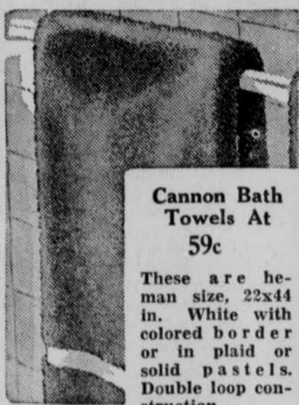
Cannon Bath Towels At 59c

Chatham blankets 25% wool, woven with 50% rayon and 25% cotton. Sateen bound. In lovely pastels or solid white.