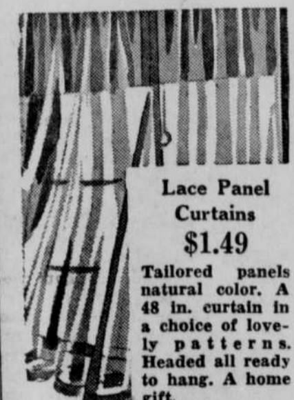
Lace Panel Curtains $1.49

Give Pequot and you give service. Snowy white, in 81x99 size. Made with deep hem. Pillow cases to match, 45c each