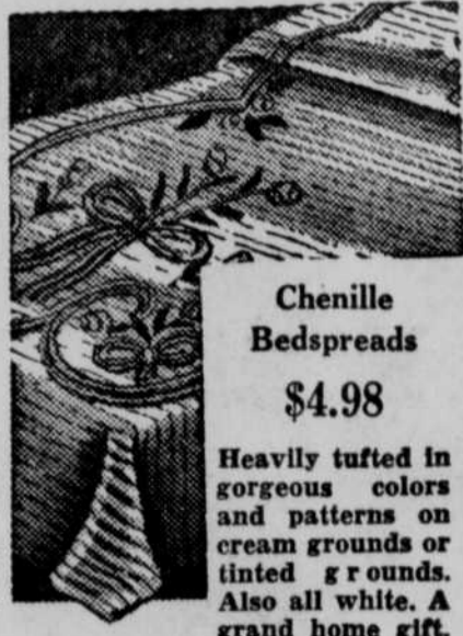
Chenille Bedspreads $4.98

Tailored panels natural color. A 48 in. curtain in a choice of lovely patterns. Headed all ready to hang. A home gift.