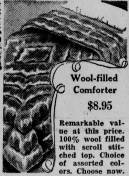
Wool-filled Comforter $8.95

Exquisitely patterned. 72x90 in. size. Natural or French ecru. The gift de luxe for the woman who entertains.