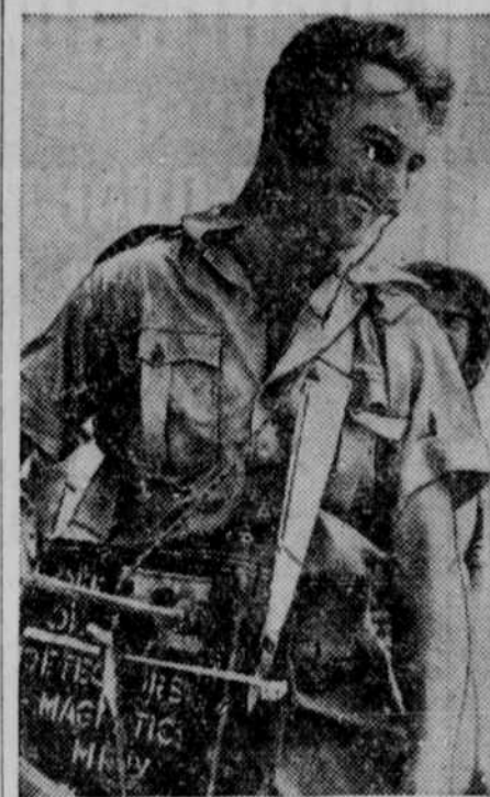
Mines, which take the place of barbed wire, are playing an important role in the war on the African front. The British mine detector is the best bet to counteract these hidden monsters. When the device detects a mine, certain sounds reach the earphones of the sappers, and they go and render the mine useless. Their work requires an unusually high degree of skill and courage. The detector, until now a little mentioned weapon, played an important part in the recent Allied victory in Egypt. Picture shows a sapper holding a mine detector.