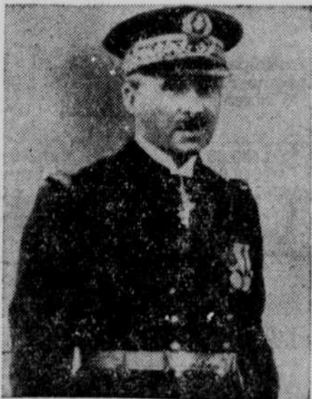
One of the big question marks has been the ultimate destination of the French fleet, which was anchored at Toulon. Admiral Laborde (above), commander of the fleet, was quoted by Vichy as having declared allegiance to Marshal Petain.