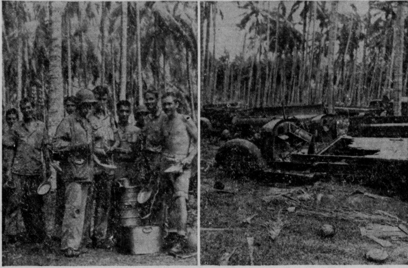
Accurate naval gunnery from U. S. ships lying off Guadalcanal shattered these Jap trucks (right) during the early stages of the Battle of the Solomon Islands. The truck in the foreground appears to have suffered a direct hit. Picture at left illustrates the expression "come and get it." And that's just what these U. S. marines on Guadalcanal island are doing. The fighters look both happy and husky as they line up for chow.