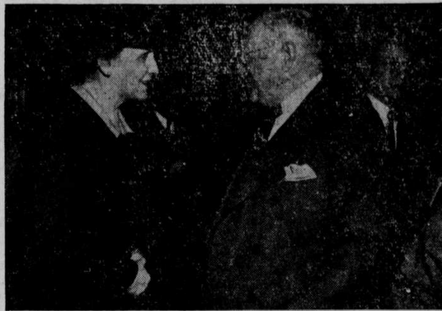
Mrs. Nellie Tayloe Ross, director of the U. S. mint, chats with Sen. Robert Wagner of New York, chairman of the senate banking and currency committee, when Mrs. Ross appeared before that committee to testify. The group is considering a request for authorization to substitute other materials for the strategic metals now used in minor coinage.