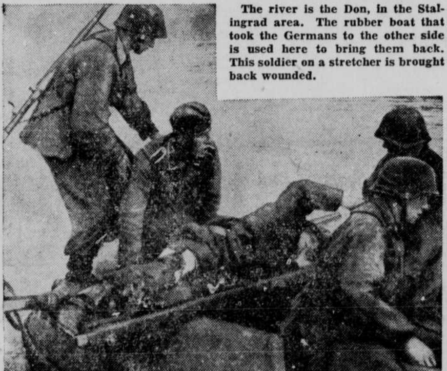
The river is the Don, in the Stalingrad area. The rubber boat that took the Germans to the other side is used here to bring them back. This soldier on a stretcher is brought back wounded.