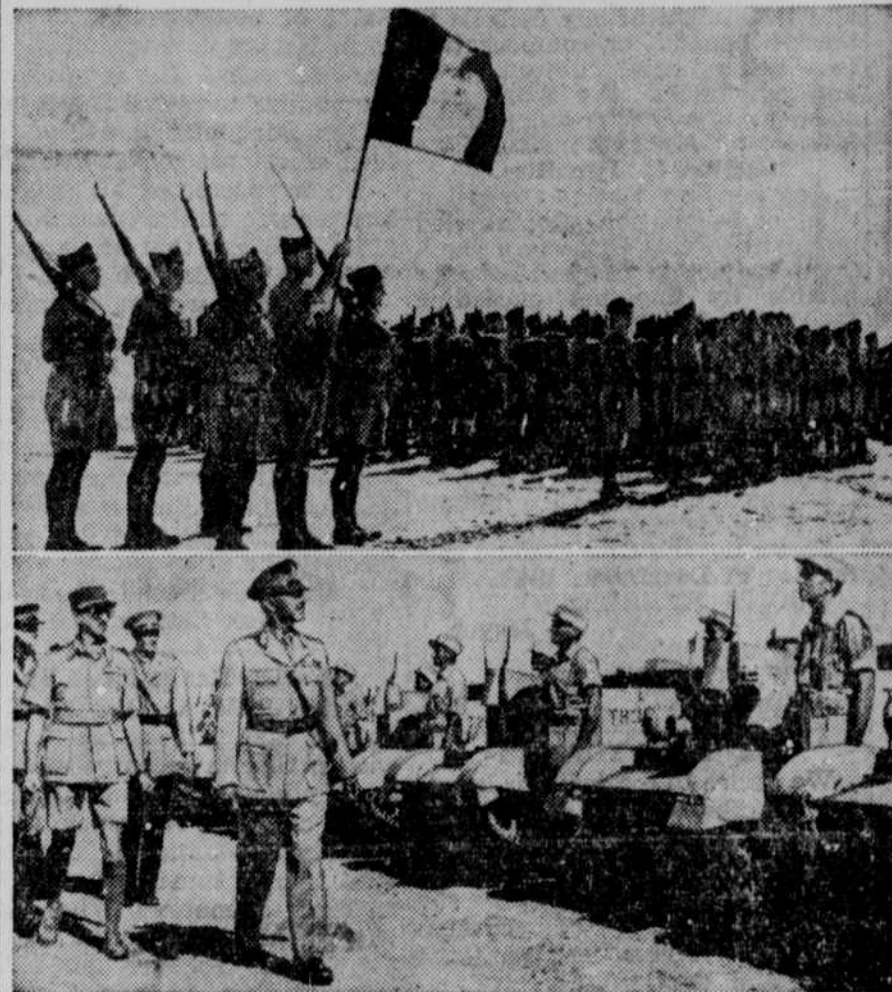
General Alexander, commander in chief of the British Middle Eastern forces, recently decorated a number of Free French officers and men who distinguished themselves at Bir Hacheim. At top Free French infantrymen are shown as they were reviewed by the C-in-C. Lower photo shows General Alexander inspecting speedy Bren gun carriers and crews.