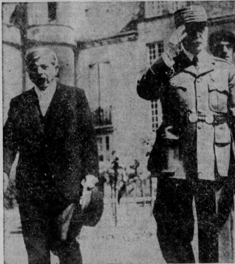
This photo, published in a German propaganda magazine, shows Pierre Laval with Marshal Petain, aged chief of state of France, as they inspected troops at Vichy before the Nazis took over what was left of France. Petain solemnly named Laval fascist dictator and Petain's presumptive heir to replace Admiral Darlan who "sold out" to Allies.