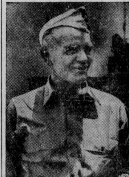
Vice Admiral William F. Halsey, whose smashing victory in Round 2 of the Solomon Islands battle eliminated many Jap warships. Halsey is a sailor's sailor and doesn't follow any of the rules.