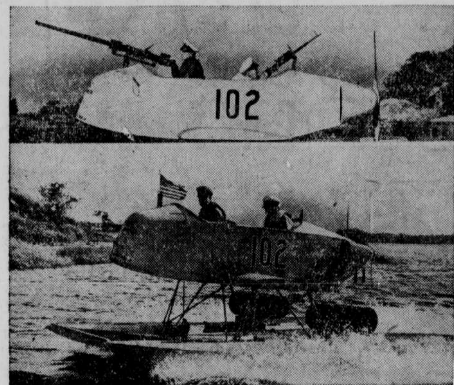
Newest weapon to combat the submarine menace is the sea-skimmer sub-chaser, which hops the waves at 50 miles per hour. It is armed with four depth charges, which can be replaced by torpedoes. Except for the engine and propeller, it is built entirely with non-strategic material—plywood plastic—and can be molded out by the thousands in a short time. As it is not driven by a water propeller it cannot be detected by submarines. Top photo shows the two-man crew at the guns. Bottom photo shows the sub-chaser skimming over the water.