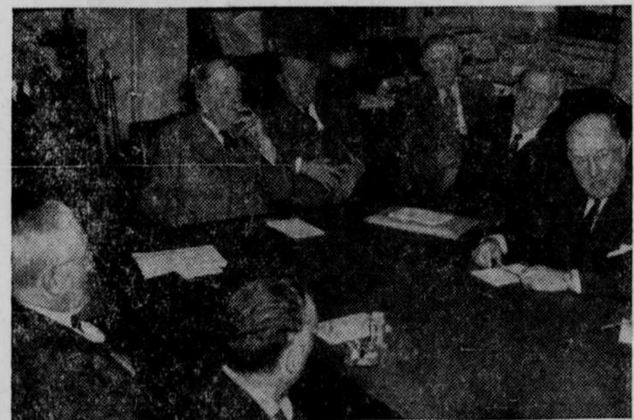
The new rubber director, William M. Jeffers, is shown as he appeared before the senate agriculture committee on a plan to substitute rayon for cotton in the manufacture of tires. Photo shows, left to right (bottom center), official reporter; Senators Norris, George, Smith (chairman), McKeller, Bulow, Aiken; and William Jeffers, witness.