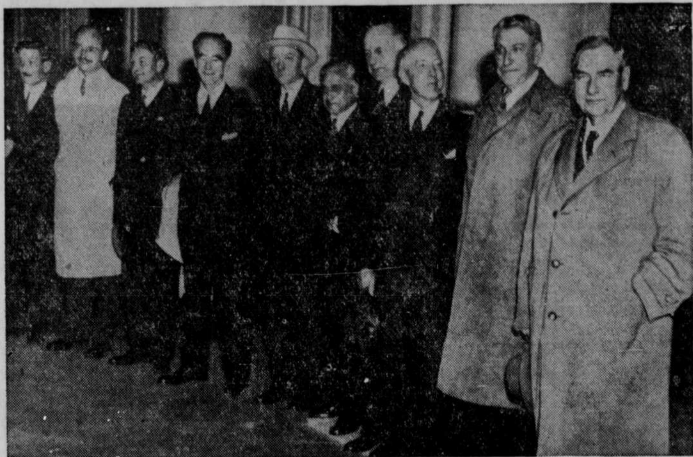
Members of the Supreme Court of the United States are shown paying their annual visit to the President at the White House. Left to right, Solicitor General Charles Fahey, Attorney General Francis Biddle, and Associate Justices Robert H. Jackson, Frank Murphy, William D. Douglas, Felix Frankfurter, Stanley Reed, Hugo L. Black, Owen J. Roberts and Chief Justice Harlan F. Stone. James Byrnes, the ninth justice, resigned to become director of economic stabilization.