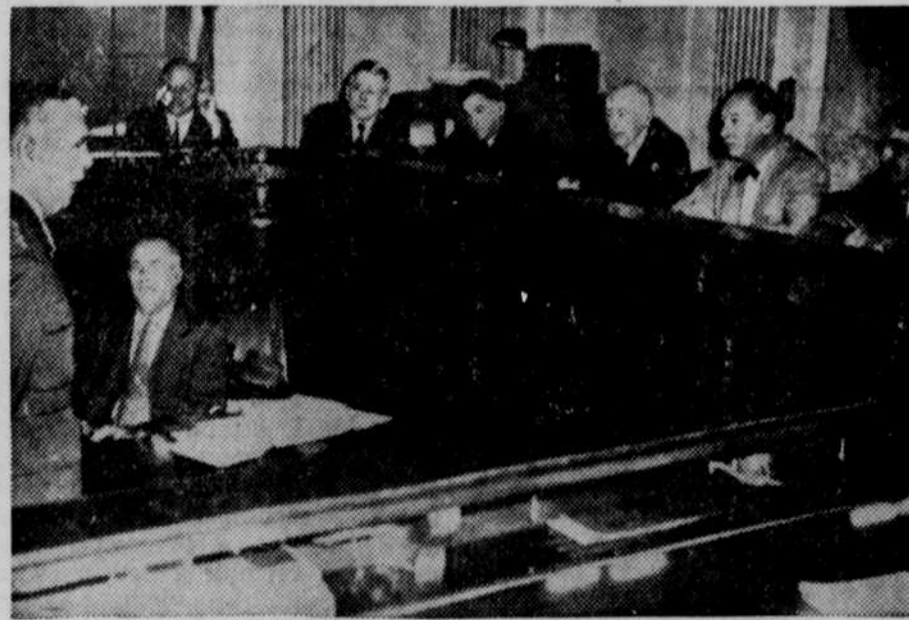
Photo shows the senate military affairs committee as it opened hearings on bill to authorize drafting of 18 and 19-year-old youths. General George Marshall was the first witness. He is shown addressing the committee. Left to right: Senators Bilbo, Schwartz, Downey, Thomas, Reynolds (chairman), and Gurney, who sponsored the bill in the house.