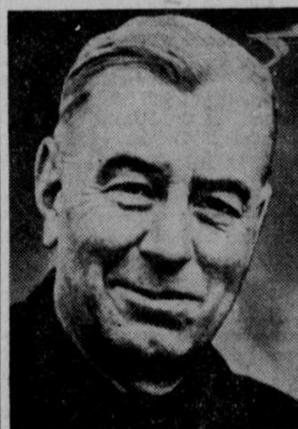
Gordon Conant, who has been sworn in as premier of Ontario, succeeding Mitchell F. Hepburn. Conant was attorney general in the Hepburn cabinet, and will retain the post for the present.