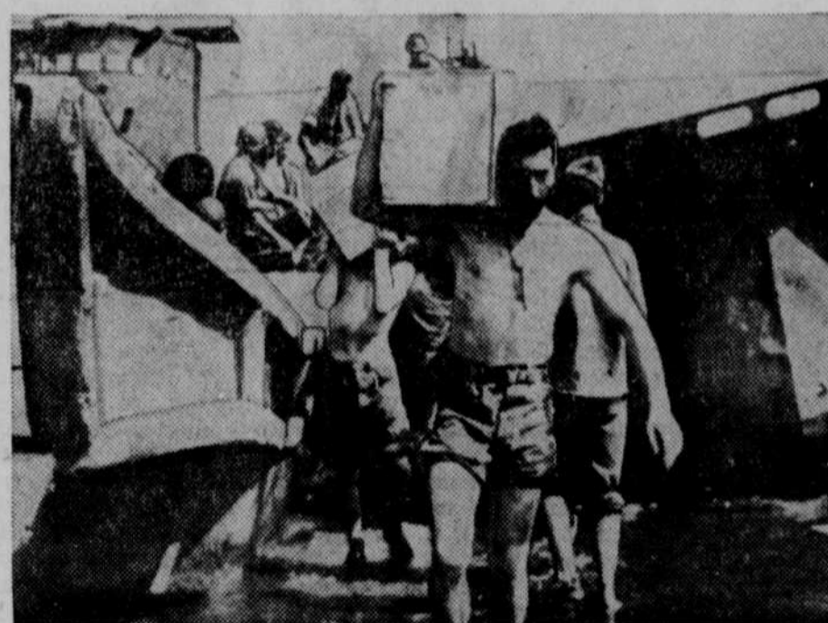
A working party of U. S. marines is shown unloading supplies from a landing barge, in preparation for the Jap offensive to regain the strategic Guadalcanal airport, in the Solomon Islands.