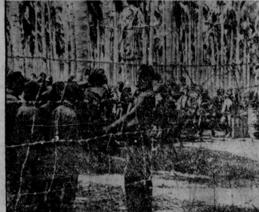
This group of Jap workmen, herded behind barbed wire enclosure, were captured by U. S. marines on Guadalcanal island. The marine in the center barks out orders to the Japs.