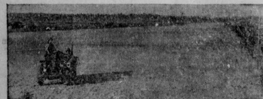
Runway of the base on Guadalcanal island that the Japs had 85% completed when in dropped the U. S. marines and took it.