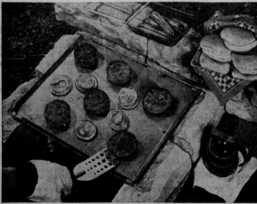
These Barbecued Hamburgers Are Appetite-Tempting! (See Recipes Below.)