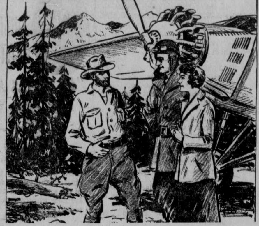
with several days' growth of beard grinned a welcome.

we can have luncheon?" So easily and casually he an- stream shook violently. A bear!