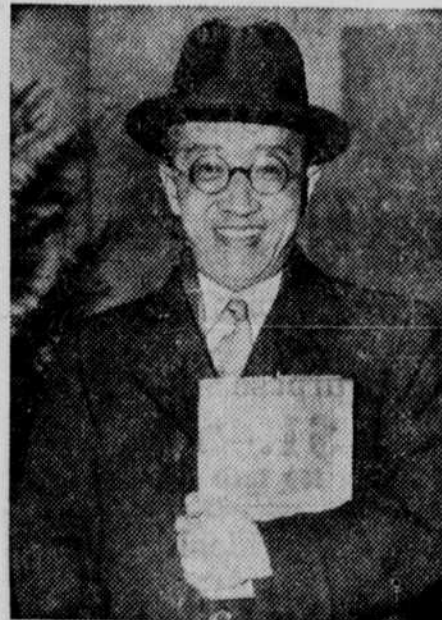
Chinese ambassador, Dr. Hu Shih, leaves White House with book, "The Personal Papers of Franklin D. Roosevelt," presented by staff and autographed by the President.