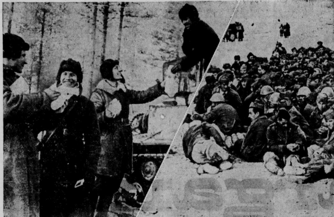
Smiling cheerfully as they push German forces back the way they came, members of this Russian tank crew (left) halt for brief pause in their march westward, for lunch. Rigors of the Russian winter seem to have no terrors for these hardy soldiers. Right: These Italian prisoners in the Libyan desert seem too miserable to attempt to escape, and yet they are guarded carefully before being shipped to a concentration camp.