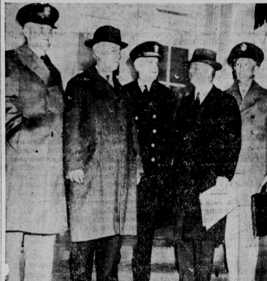
President Roosevelt and Winston Churchill called the first meeting of the U. S.-British war council at the White House, to draft a "unity of action" grand strategy program for all anti-Axis nations. The U. S. contingent is shown here. Left to right: Maj. Gen. H. H. Arnold, chief of army air corps; Secretary of War Stimson; Adm. H. R. Stark, chief of naval operations; Secretary of Navy Knox; Gen. Geo. C. Marshall, U. S. army chief of staff.