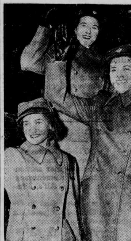
First members of the Canadian women's army corps to leave Canada on active service are shown as they left Ottawa for Washington, D. C., where they will take over duties formerly performed by men at the Canadian legation. All are company sergeant majors.