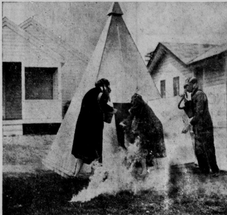
Mass production air raid shelter, shown during a tryout in Boston. It is bolted on a concrete base. Ventilation comes in at the top where the little cone crowns the steel pyramid. Yes, this shelter can accommodate 12 people. With air raid alerts on both coasts, interest in shelters is increasing. Some can be bought for as little as $200.