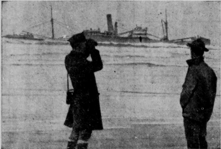
Two members of an army beach patrol are shown looking at the stranded Matson line steamer, Mauna Ala, which ran aground near Astoria, Ore., while en route to Hawaii. The steamer was the first victim of the West coast blackout, having run aground when she lost her bearings because of darkening of lighthouses during an air alert.