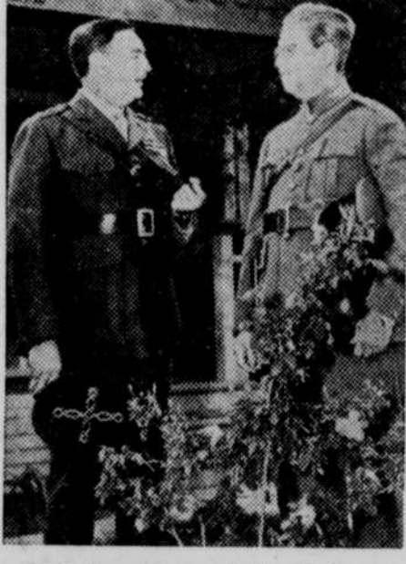
Maj. Gen. Price of the U. S. marine corps (left) visits Gen. Contreras, commander of the second military zone of Baja, Lower California, in Tijuana.