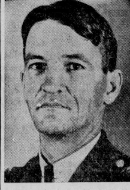
Lieut. Col. C. L. Chennault, famous U. S. flying officer, who will direct a Chinese aerial offensive against Jap bases. The 51-year-old Texan is a veteran of World War I.