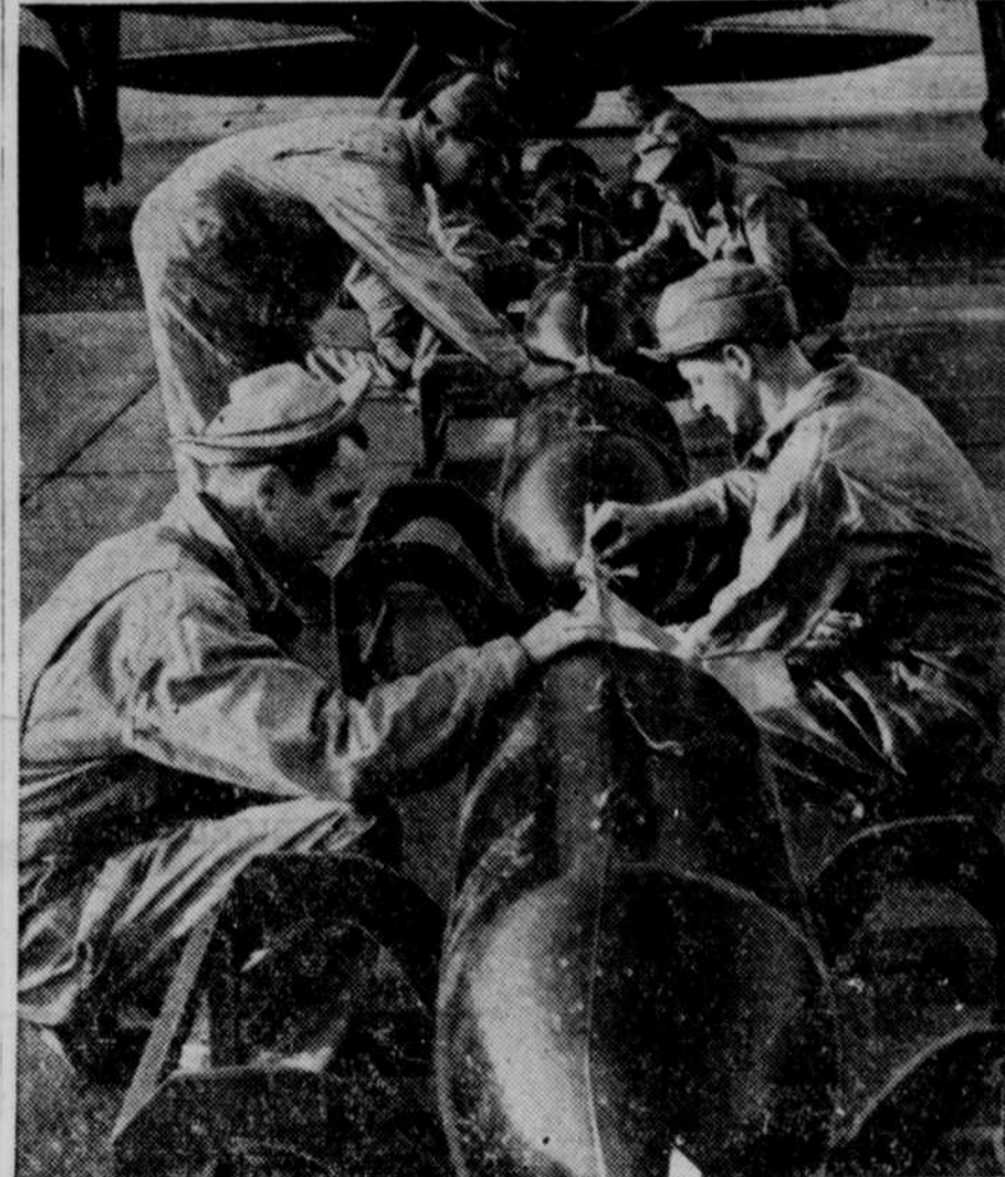
At a U. S. army airport, somewhere in the U. S., a ground crew is making adjustments to a string of 600-pound bombs before the missiles are loaded into a bombing plane for delivery at . . . ?