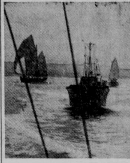
A motor torpedo boat, the British navy's newest weapon for harbor defense, makes a test run across Hong Kong harbor. In the background are two lumbering Chinese junks. This "Gibraltar of the East" has lent its might in repelling Jap attacks.