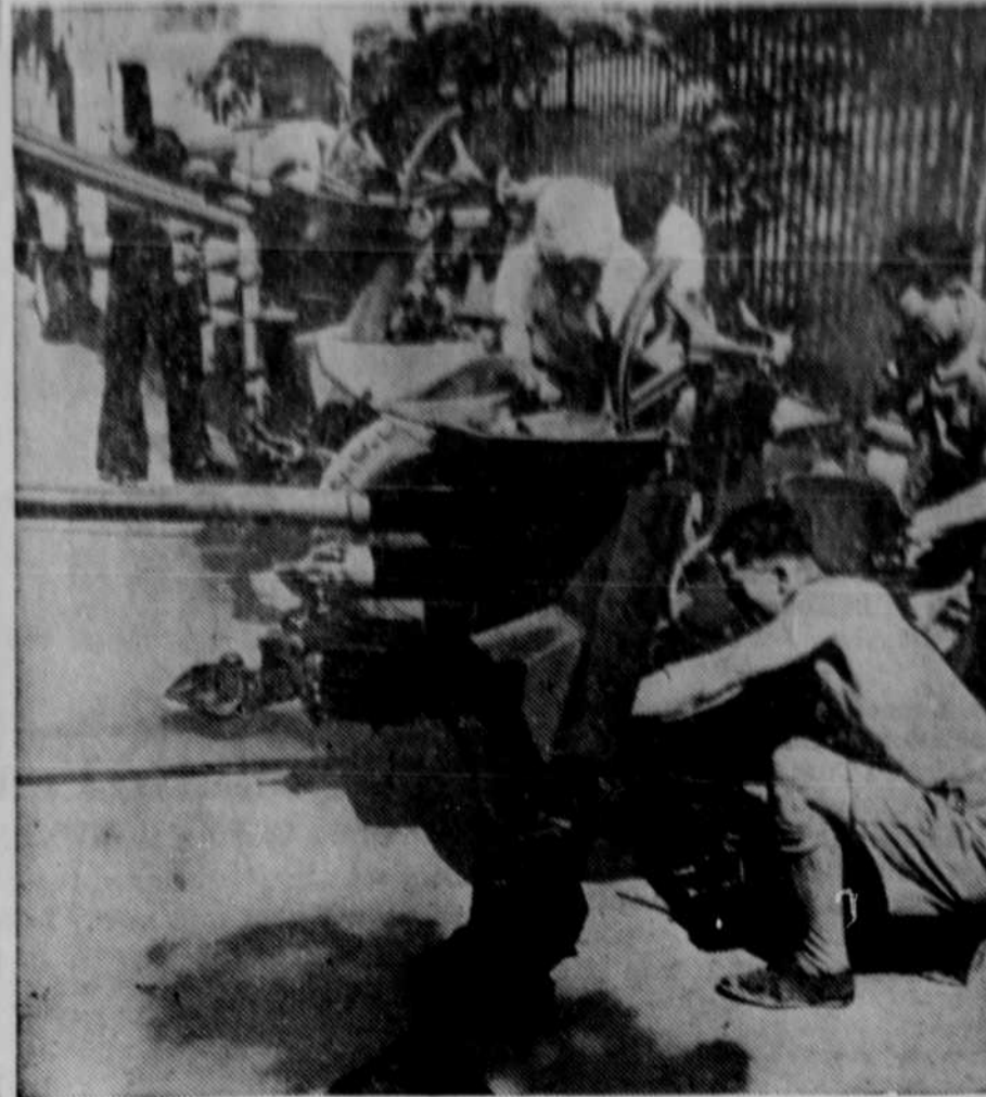
These Breda guns, captured from the Italians in Libya, are being reconditioned in Malaya for use against Jap invaders. During Wavell's desert blitz a tremendous amount of Italian equipment was taken by the British. It has since been useful on other fronts, and will serve the allied cause again in Malaya.