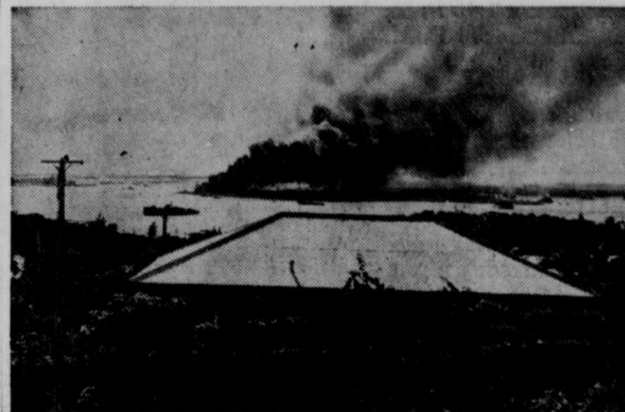
The U. S. S. Arizona on fire and sinking in Pearl Harbor after sneak raid by Japanese bombers. The 25-year-old battleship was destroyed by the explosion of the first of its boilers and then its forward magazine, due to a bomb which was said to have literally passed down the smokestack.