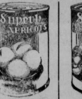
2 16-oz. Cans 25c