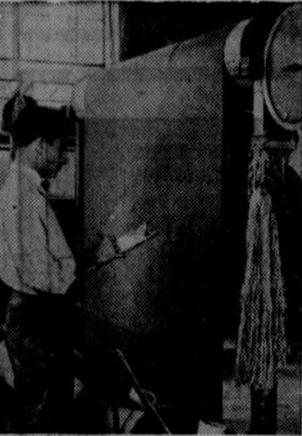
Trained eyes scan every inch of this bolt of cloth as it is unwound from roller to roller. A defect would cause rejection.