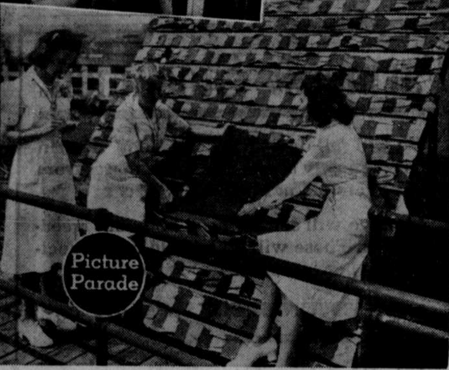
Here on the roof of the quartermaster's department you see fabrics undergoing a weather test.