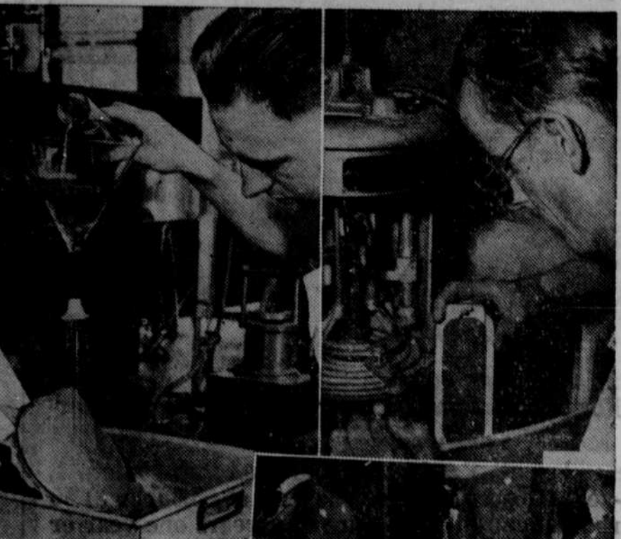
Picture above (left) shows a sample being treated to a rain test. The cloth must be 100% water repellent.