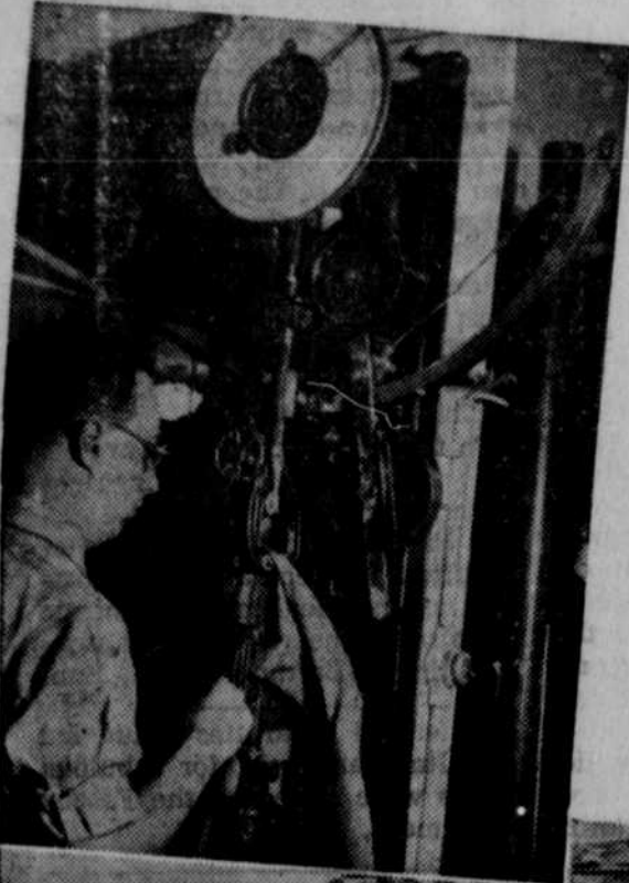
The best isn't good enough for Uncle Sam's army when it comes to clothing. That is why the army maintains a "House of Magic" in the quartermaster's department in Philadelphia. It is the duty of this "House of Magic" to check on the quality of all clothing equipment destined for the army. Here are a few of the steps taken in the manufacture of uniforms for our ever-growing army.