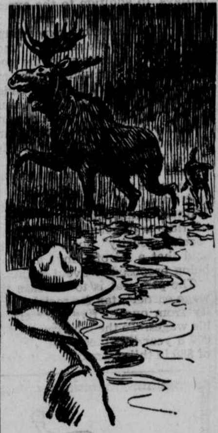
The beast plunged on.

"Corinne knows nothing of this letter. She hates Jules Isadore but I dare not trust her. Louis cannot read English so is ignorant of its contents. If you say, 'Yes!' and anything prevents your reaching there Friday, leave a note under the white quartz rock on the edge of the beach stating when you will come and Louis will get it. For God's sake, Garry Finlay, don't think this note is an Isadore trick and I'm such a low beast. I'll kill myself rather than stay here through the summer. I've got to get out! I've got to get out! I've got to get out!" "Lise Demarais." (TO BE CONTINUED)