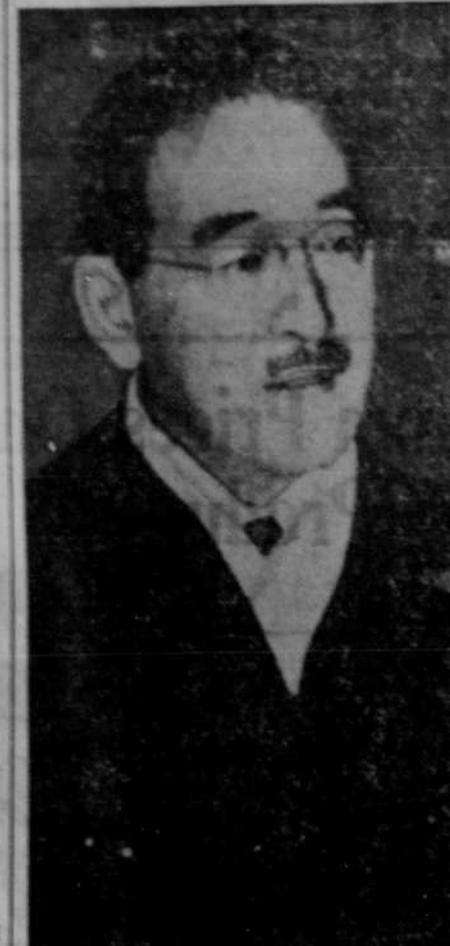
Saburo Kuruu, special Japanese envoy who flew here from Tokyo on a Pacific clipper for a "final" talk to ease the "very serious situation in the Pacific." Kuruu was former ambassador to Berlin, where he signed the Axis pact for Japan.