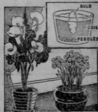
Flowers at Different Periods.

A SUCCESSION of lovely blooms in your home all winter! That's your reward—if you start potting bulbs now. Clever to choose stunning "show pieces" that flower at different periods—white callas start blooming in January, colorful amaryllis and daffodils a little later. Before these and in between you can always have the fragrant narcissus.