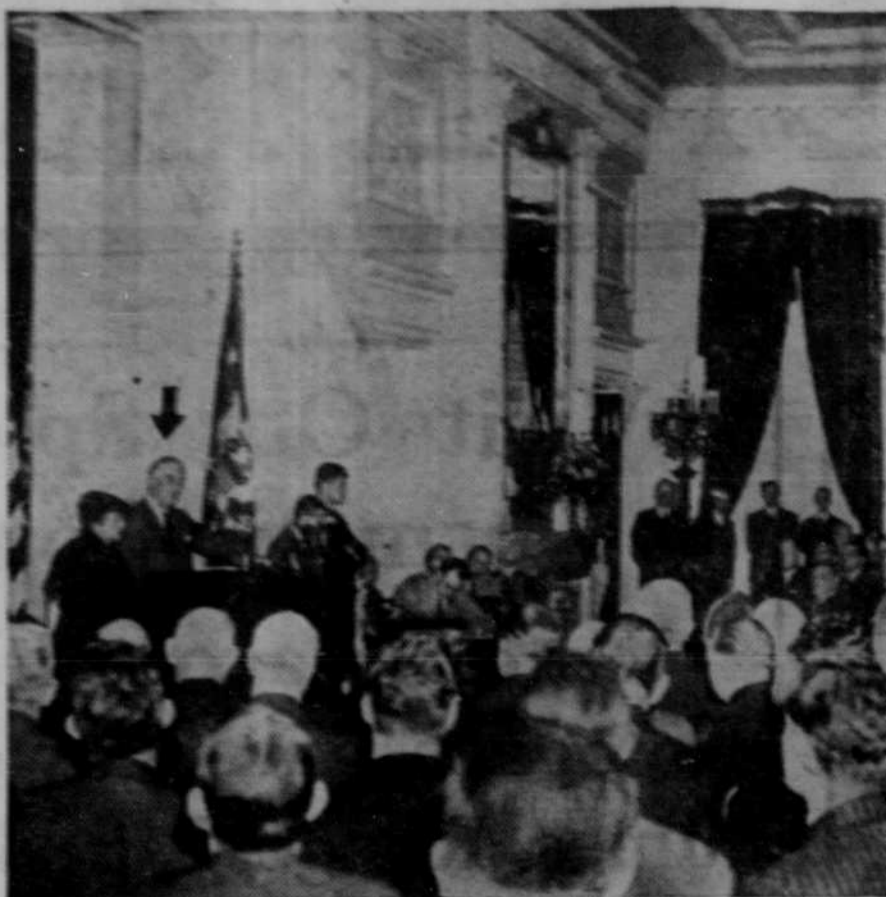
President Roosevelt addressing the 250 delegates of the International Labor organization at their annual meeting in the East room of the White House, at which 33 nations were represented. The address was carried to the nation by radio. The President condemned the "mis-guided" few industrialists and labor leaders "who place personal advantage above the welfare of their nation," and warned that every American faces "much greater sacrifices in the future." Photo shows Secretary of Labor Perkins as she introduced the President to the meeting.