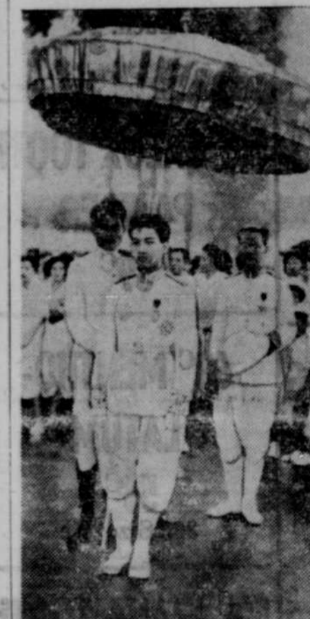
First picture of Sihanok, new king of Cambodia. He is pictured standing ominously in the rain during last rites for King Sisovad-Monivon, former ruler of the kingdom of 3,000,000. Most important resource is its tin. The kingdom is now largely under Japanese influence.