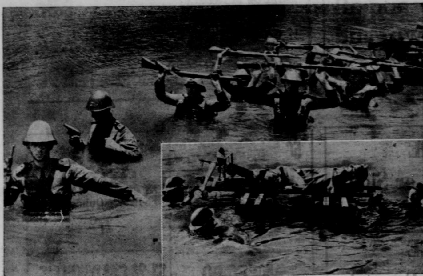
Marines of the royal Netherlands navy, still loyal to their exiled queen, are pictured above crossing a river, fully dressed, during maneuvers at Sourabaya, Netherlands East Indies. Japan is their nearest Axis enemy. Inset: A "casualty" is floated across a river on a makeshift raft during demonstration staged by Britain's royal army medical corps. Buoyancy is given by empty oil cans.