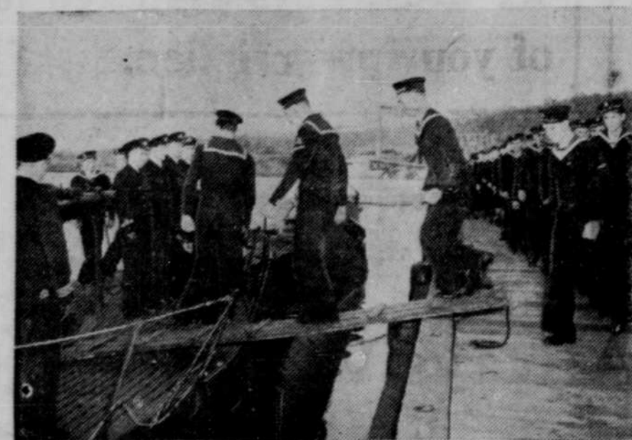
Under terms of the lend-lease act, two average United States submarines were turned over to the British and Polish navies at the Groton submarine bases, Groton, Conn. The Polish crew is shown going aboard the submarine, an 800-ton craft built in 1931. The British got a 600-ton submarine built in 1918.