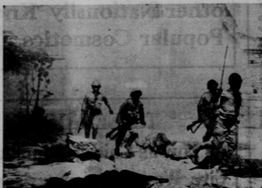
This remarkable photograph, one of the most vivid to come out of the Sino-Japanese war zone, shows a vanguard of Japanese shock troops led by a sword-brandishing officer, rushing the burning camp of the Chinese soldiers at Changsha. Changsha was one of the most important positions of the Chiang Kai-shek forces.