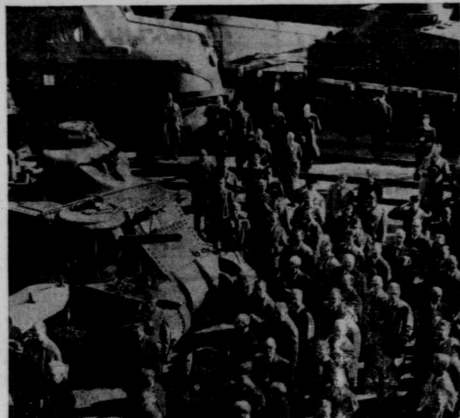
Standing at attention while the national anthem is being played at the Schenectady, N. Y., plant of the American Locomotive company during a defense day inspection of the plant. M-3 medium tank is shown at left. Another tank, on flat car in background, is about to be sent on its way to army proving grounds.