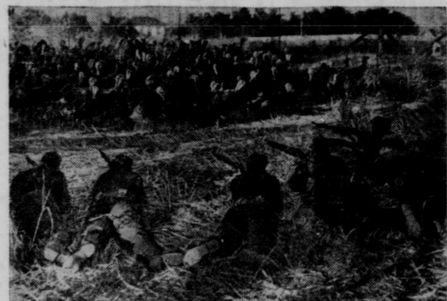
Turkey, with all the trimmings, will grace the festive board at army camps throughout the country on Thanksgiving day. These soldiers of Camp Lee, Va., could not resist their battle training as they creep up on the all-unsuspecting turkeys at the Wippenock farm, South-land, Va.