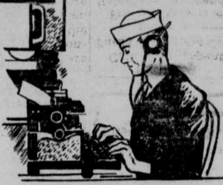
EXPERTS IN RADIO do interesting work. In civil life the pay is high. Let the Navy teach you radio work.

DO YOU KNOW that in every trade, profession and business there are successful men—men who earn five, ten and even twenty thousand dollars a year—who will tell you that they owe their success largely to the training they received in the United States Navy?