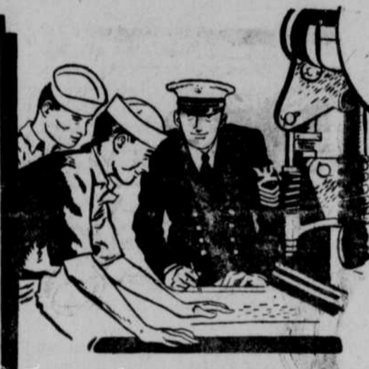
EXPERT METALSMITHS teach blue-jackets how to operate heading machine. Soon they'll be experts, too.