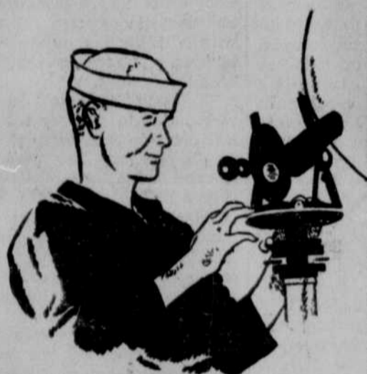
NAVY WEATHER MAN. Interested in this unique, fast-growing field? Navy training is second to none.