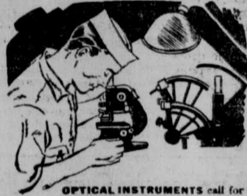
OPTICAL INSTRUMENTS call for skilled repair work. You can train in the Navy for this big-pay field.