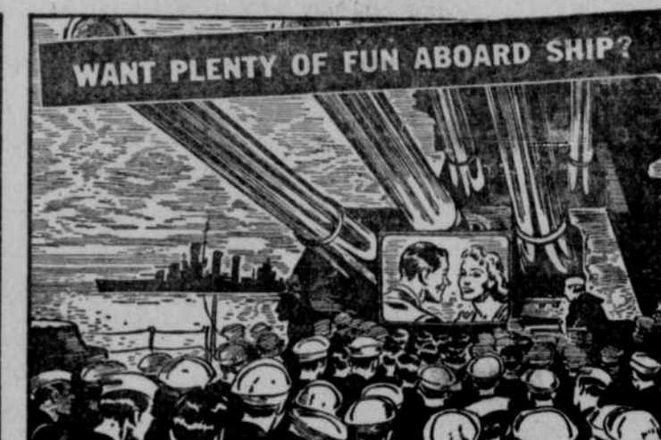
WANT PLENTY OF FUN ABOARD SHIP? YOU'LL SEE the very latest movies—free! You'll have a great time playing deck sports, boxing, wrestling. Even the work is full of thrills—like Fleet maneuvers, anti-aircraft practice, launching torpedoes, catapulting planes. And what an appetite it gives you for that grand Navy food!

NO JOB in the world offers so much as a career in the U. S. Navy or the Naval Reserve. It's interesting... healthy... full of thrills. Yet it prepares you to be a real success in life—whether you remain in the Navy or decide to return to civil life. Uncle Sam's new two-ocean Navy offers you tremendous opportunities for advancement in a wide variety of fascinating jobs. There are 45 skilled trades and vocations. If you're interested, for instance, in radio work, engineering, aerial photography, carpentry, pharmacy, welding, the Navy may spend $1500 in one year training you to become an expert in your chosen field. If you apply yourself, advancement and increases in pay will follow regularly. Before the end of your first enlistment you can be earning up to $126 a month—with your board, keep, and a complete outfit of clothing given you free! If, at the end of your term of service, you wish to get a job in civil life, your Navy training will be a tremendous asset to you. Employers the country over are eager to employ Navy-trained men.