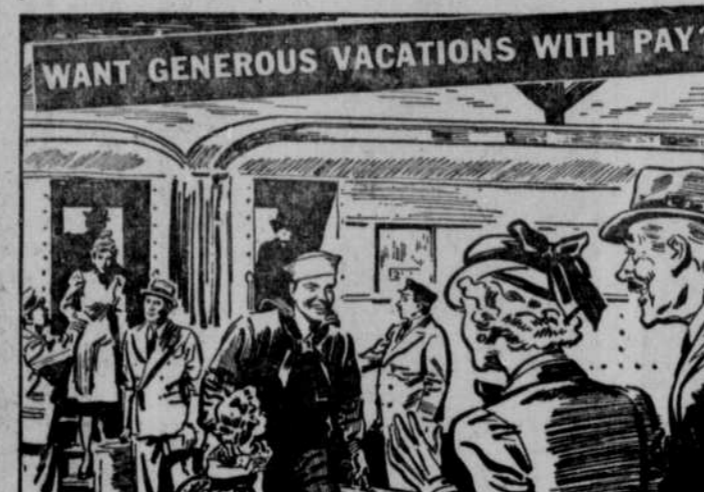
WANT GENEROUS VACATIONS WITH PAY? THINK OF THIS—when you're in the Navy, you're entitled to a generous vacation every year... and with full pay. And what a thrill you'll get when you return home on leave. Your trim Navy uniform is sure to go over big! Watch your parents beam! Everybody looks up to a Navy man!