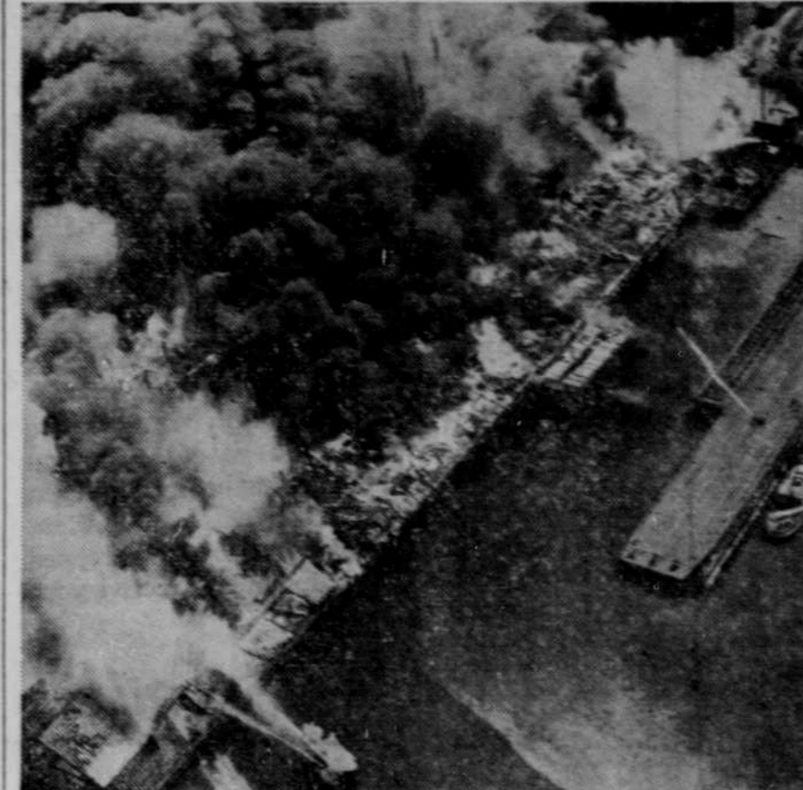
Darting as close to the flames as it dared go, a cameraman on a special plane made this unusual photo of the conflagration that swept pier 27 in Brooklyn in one of the worst fires in recent years. In the center, between both piers can be seen the Cuban liner, Panuca, ablaze. Scores of firemen were severely injured and some military supplies were damaged.