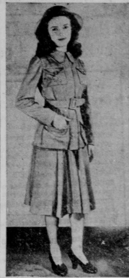
If all the air raid wardens are as easy to look at as Joan Leslie, well, the more air raids the better, says we. Miss Leslie poses here (in New York) in the first women's air raid uniform, which is completely fire resistant and protects body against fragments.