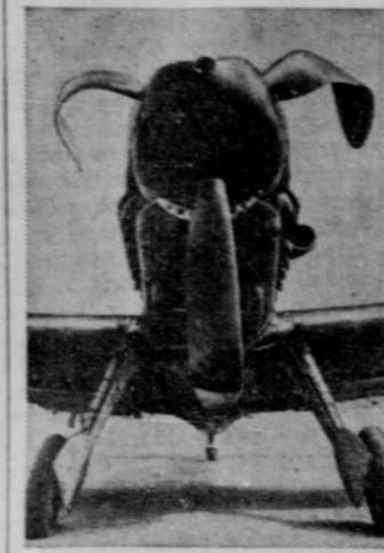
This German plane looks like it had its "ears pinned back." Not so, however. It was a fine, almost undamaged specimen of the latest German fighting plane.