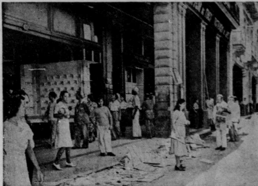
A chain of five bombs rocked downtown Havana injuring 15 persons and wrecking store fronts. Police believe the bombs were thrown by an anti-Spanish political group. The store "La Moda," well known to tourists from Miami and other parts of the U. S., is shown after the blast.