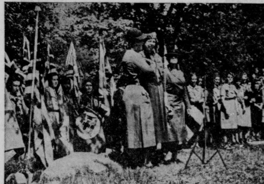
Mrs. Franklin D. Roosevelt (center) is shown with scout leaders (unidentified) as she prepared to address the second Western hemisphere encampment of Girl Scouts and Girl Guides at Camp Bonnie Brae, East Otis, Mass. Behind her are Girl Scouts from North, Central and South America and the Caribbean area.