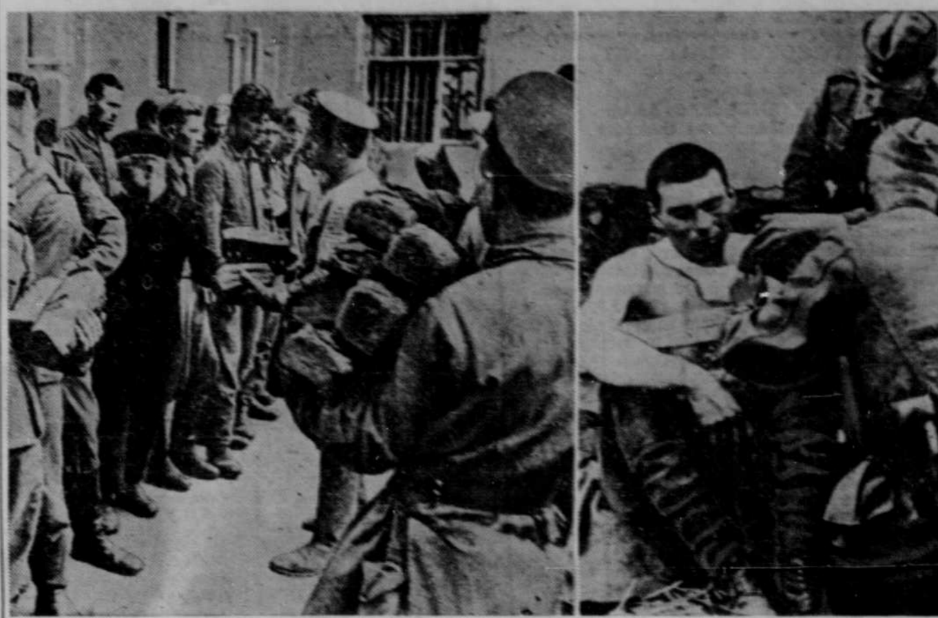
Picture at left shows captured Nazis receiving bread from Russian soldiers, according to the Moscow and London censor-approved caption. In the picture at the right German troops are giving first aid to a wounded Russian soldier. It would seem that both sides in this terrific conflict like to send out photos showing their men rendering aid to wounded enemies.