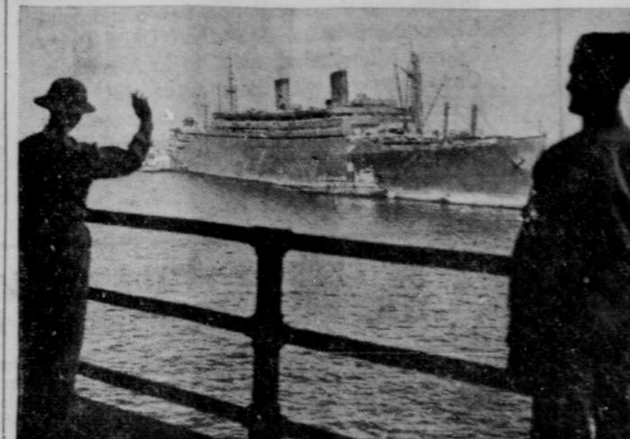
The U. S. S. Wakefield, formerly the S. S. Manhattan, is shown arriving in New York harbor with the force of soldiers who recently went south to co-operate with the U. S. marines in mimic war. Landing exercise and beach head tactics on the coast of North Carolina were high spots of the "war."