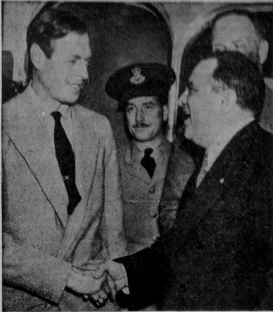
His royal highness, the duke of Kent, brother of King George VI of England, is welcomed to New York city by Mayor Fiorello H. LaGuardia. The duke, in a plane of the Canadian air force, landed at LaGuardia field, where this picture was made. He took an automobile for Hyde Park, where he spent the week-end with President Roosevelt.