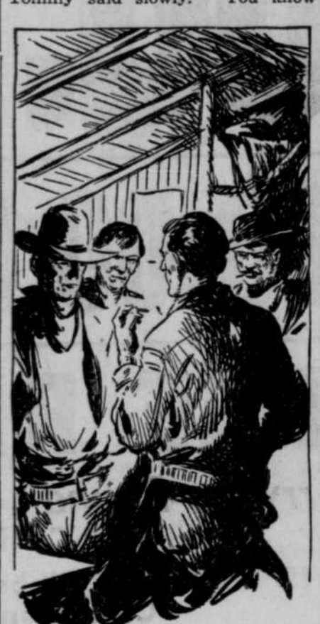
"Now I aim to square the deal."

ADVERTISEMENTS are your guide to modern living. They bring you today's NEWS about the food you eat and the clothes you wear, the stores you visit and the home you live in. Factories everywhere are turning out new and interesting products. And the place to find out about these new things is right here in this newspaper. Its columns are filled with important messages which you should read.